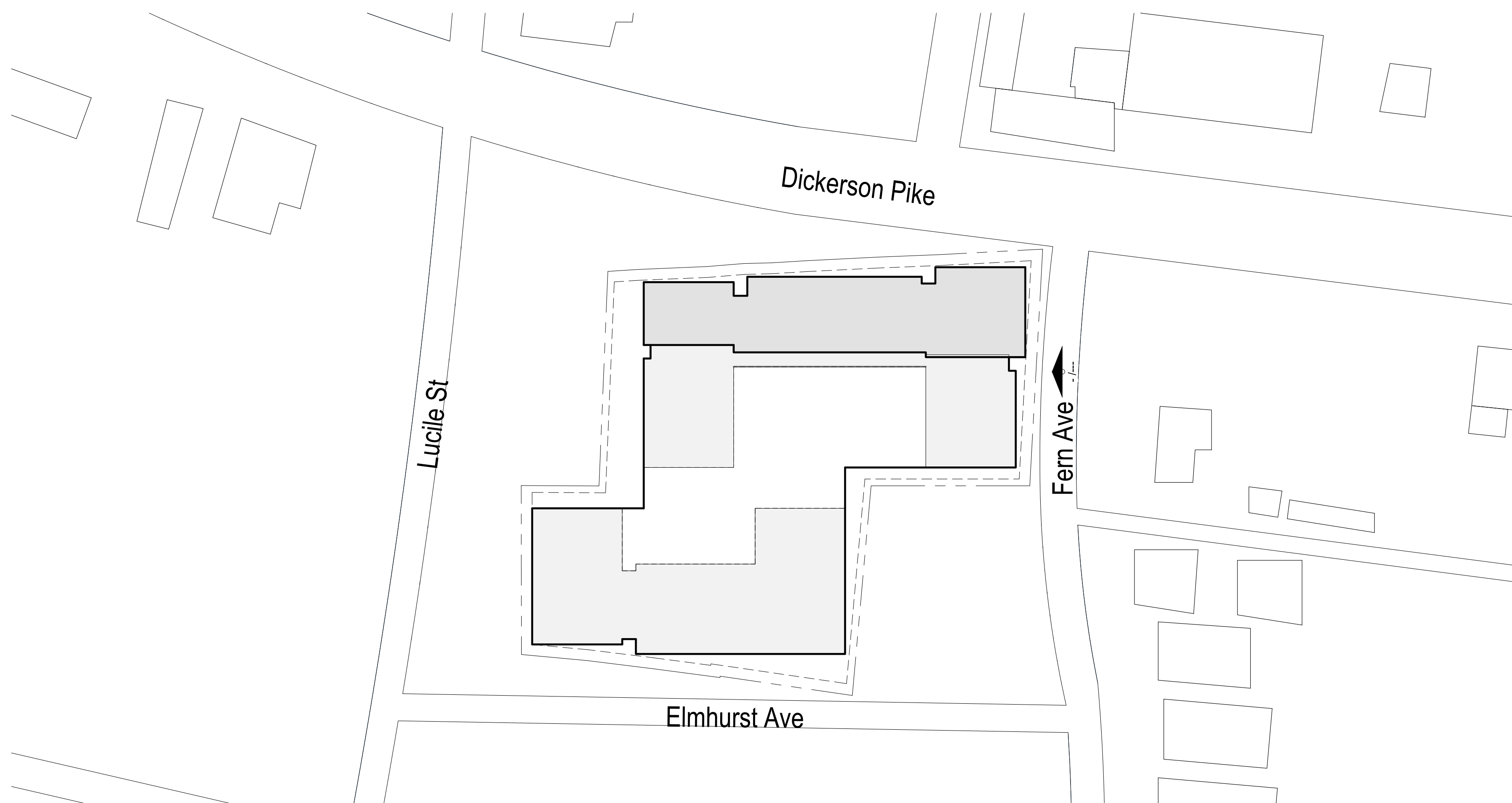
2 FLOOR PLAN 01 1" = 60'-0"