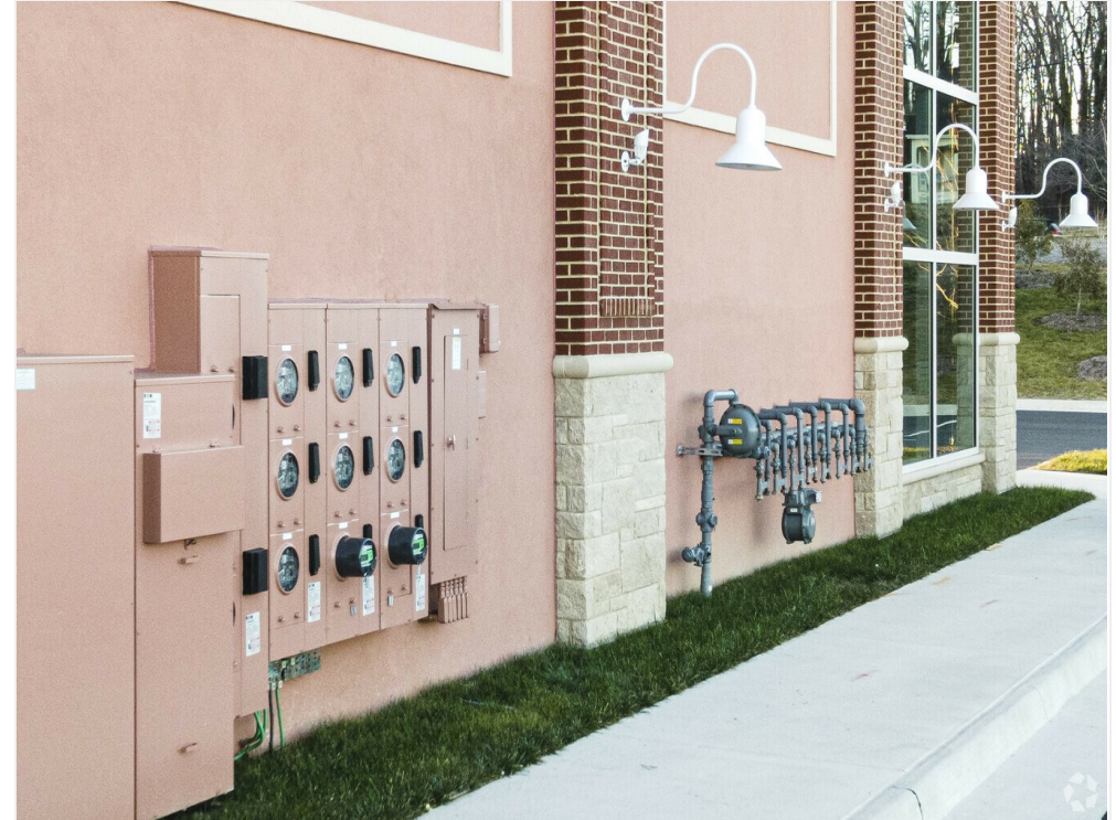
Gas & Electric