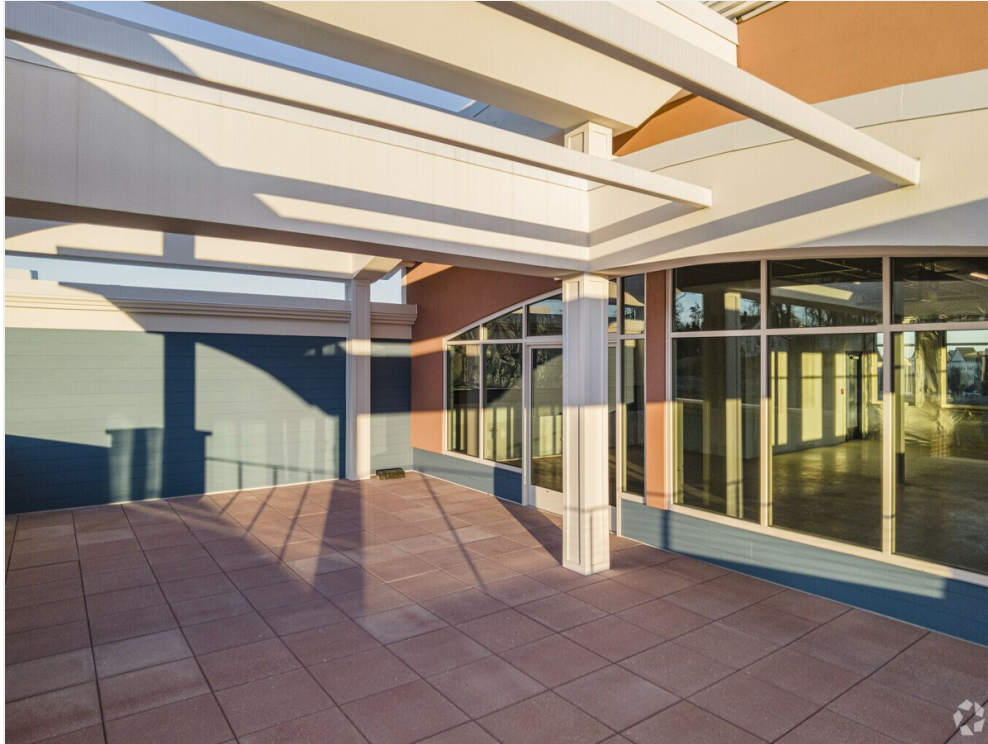
Second Floor Terrace