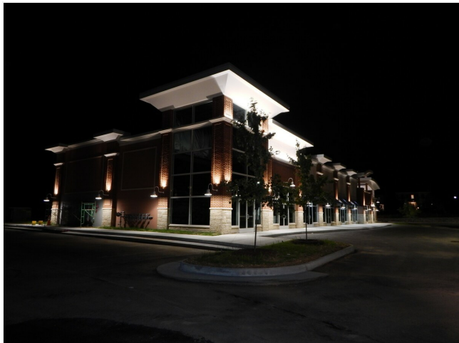
Main Tower Night