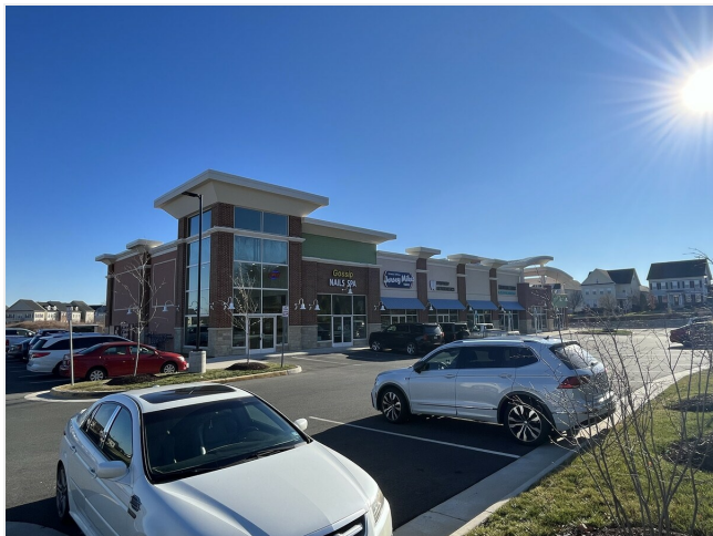
Building Frontage Unit 101

10322 Bristow Station Dr, Bristow, VA 20136