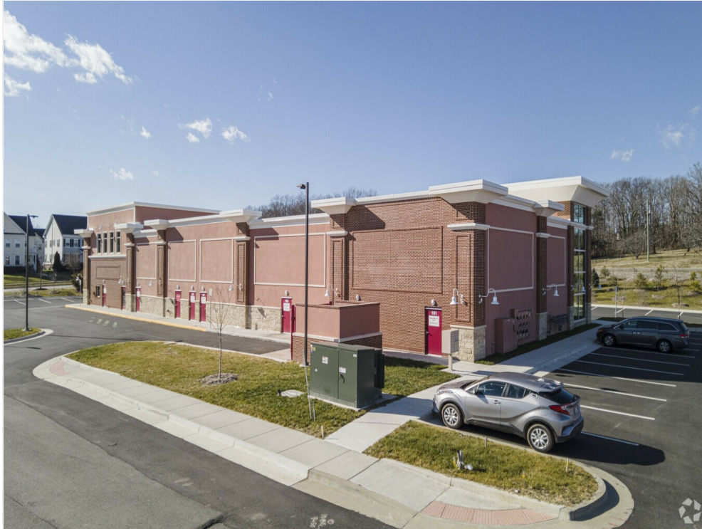
Rear of the Building