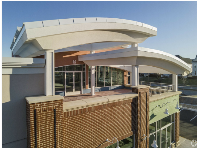
Second Floor Terrace