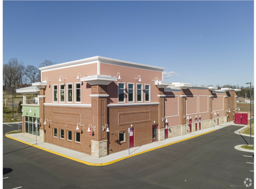
Rear of the Building