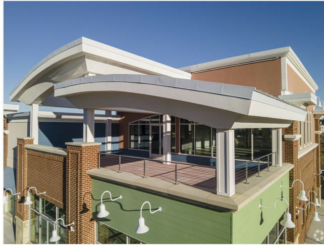
Second Floor Terrace

10322 Bristow Station Dr, Bristow, VA 20136