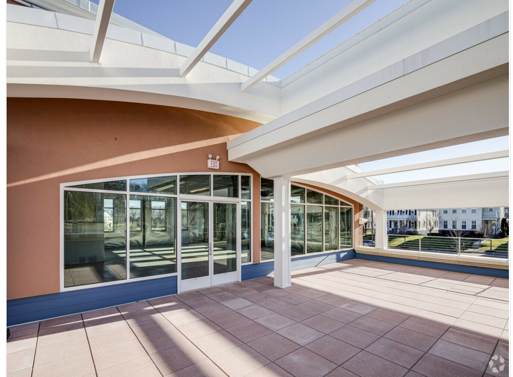
Second Floor Terrace