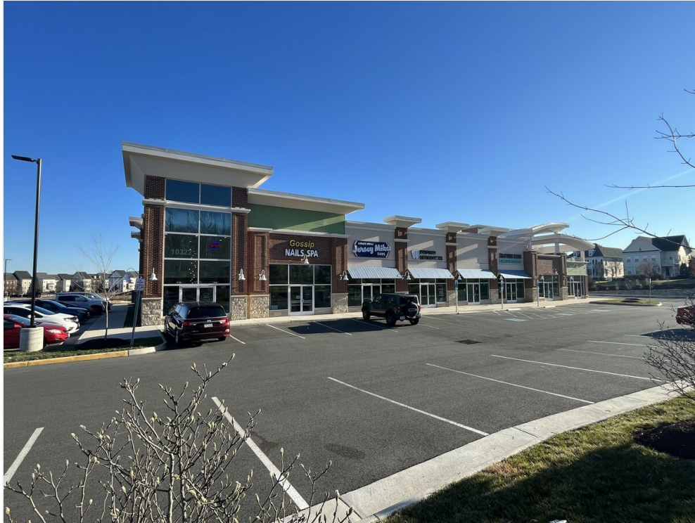
Building Frontage Gossip Nails, Jersey Mikes