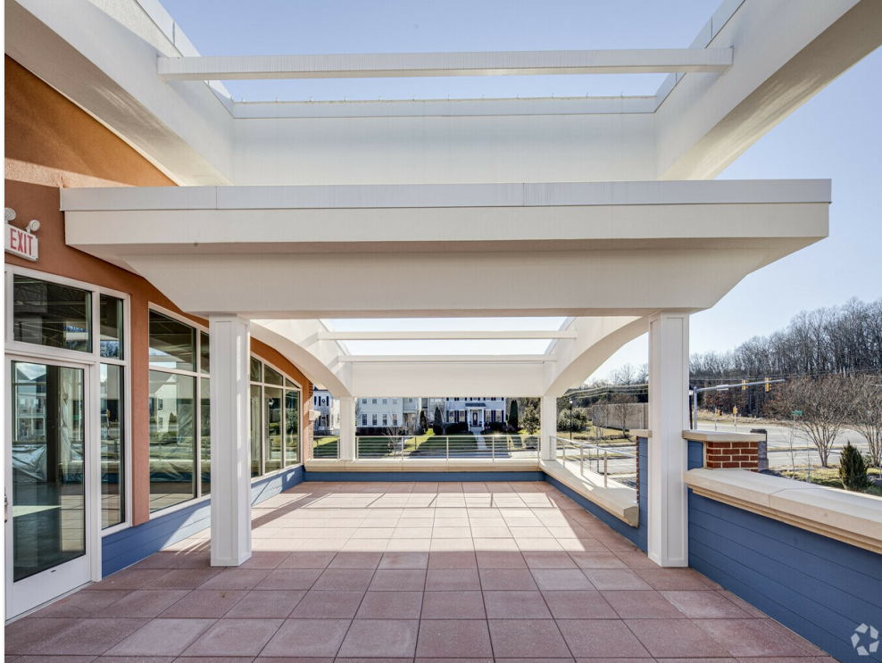
Second Floor Terrace