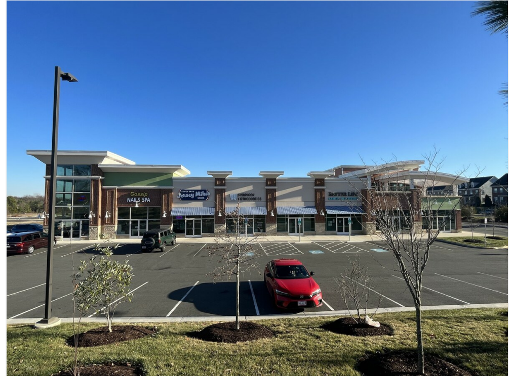
Building Frontage facing R28