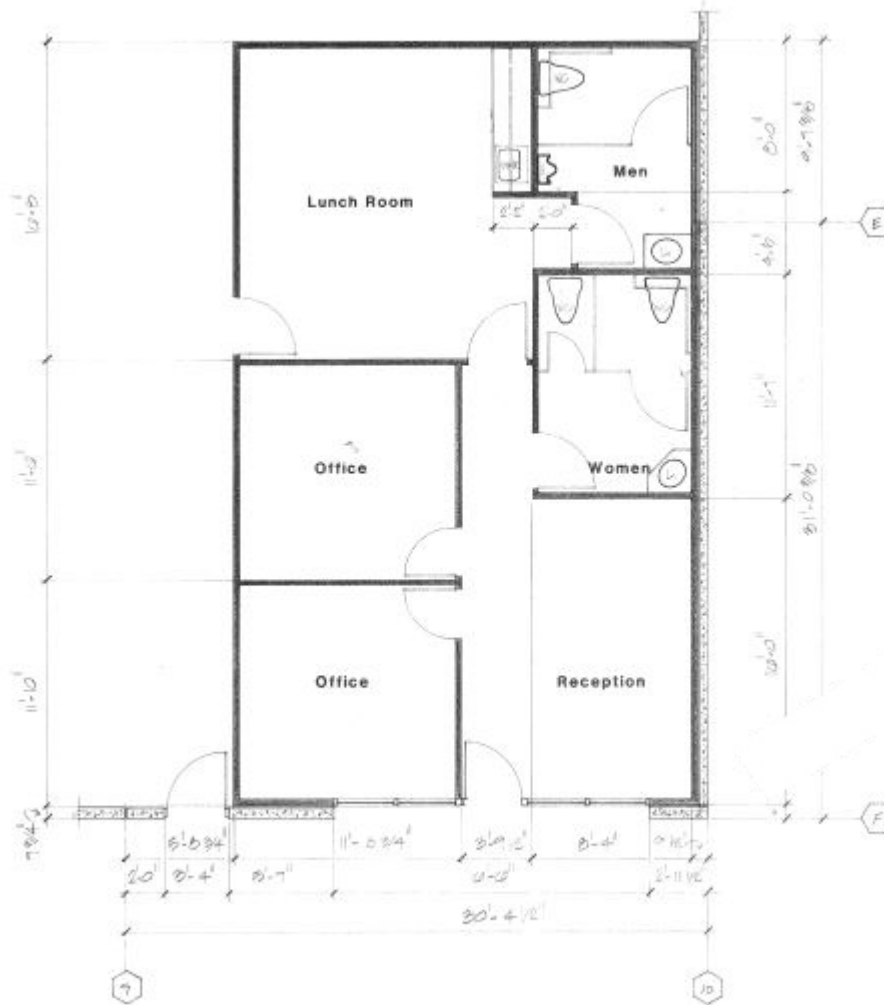
OFFICE FLOOR PLAN