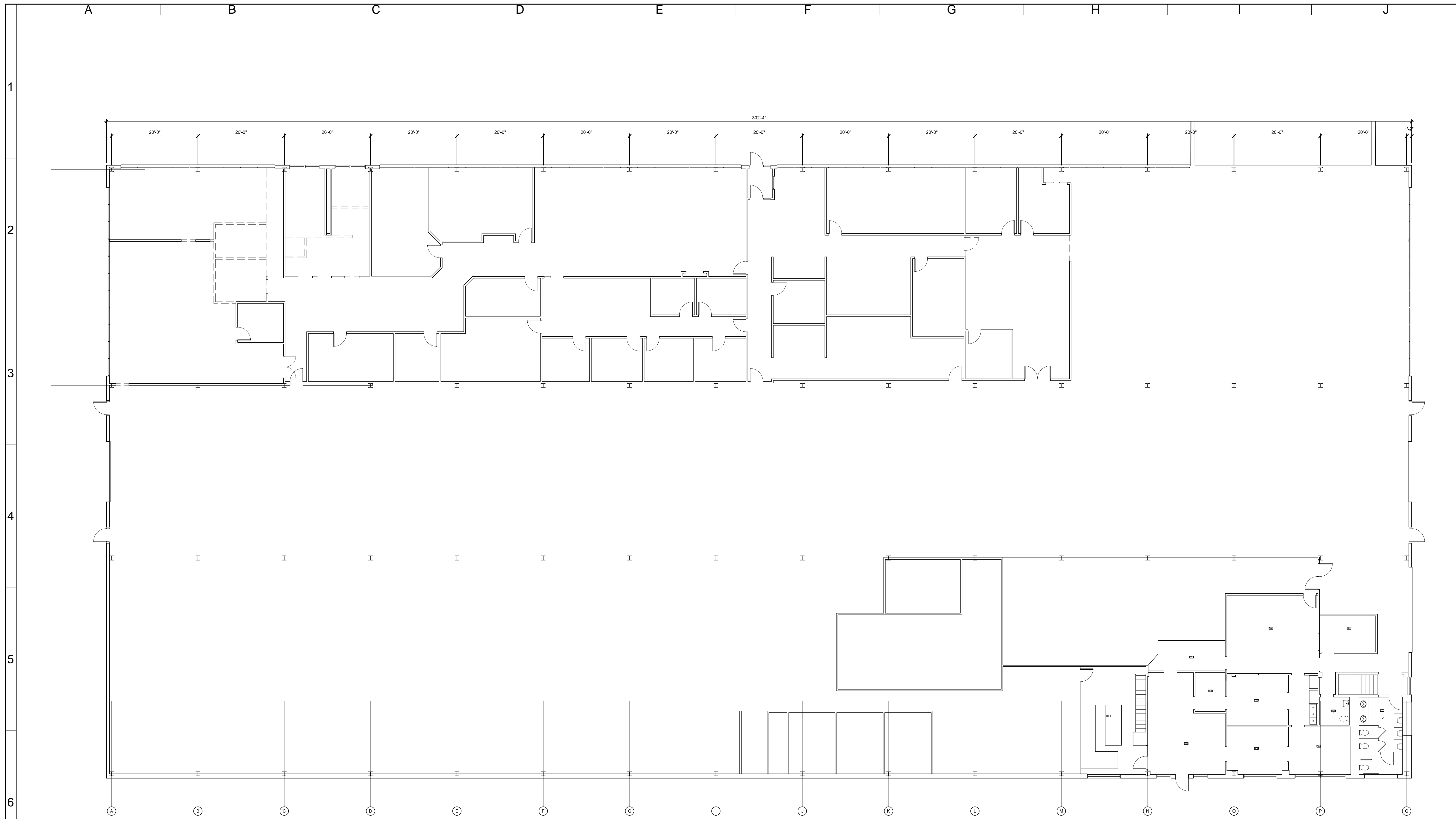
1 FLOOR PLAN A1 SCALE: 3/32" = 1'-0"

THIS DRAWING IS THE PROPERTY OF CLARIS CONSTRUCTION HAS BEEN PREPARED SPECIFICALLY FOR THE OWNER FOR THIS PROJECT AT THIS SITE, AND IS NOT TO BE USED FOR ANY OTHER PURPOSE, LOCATION, OR OWNER WITHOUT WRITTEN CONSENT OF CLARIS.