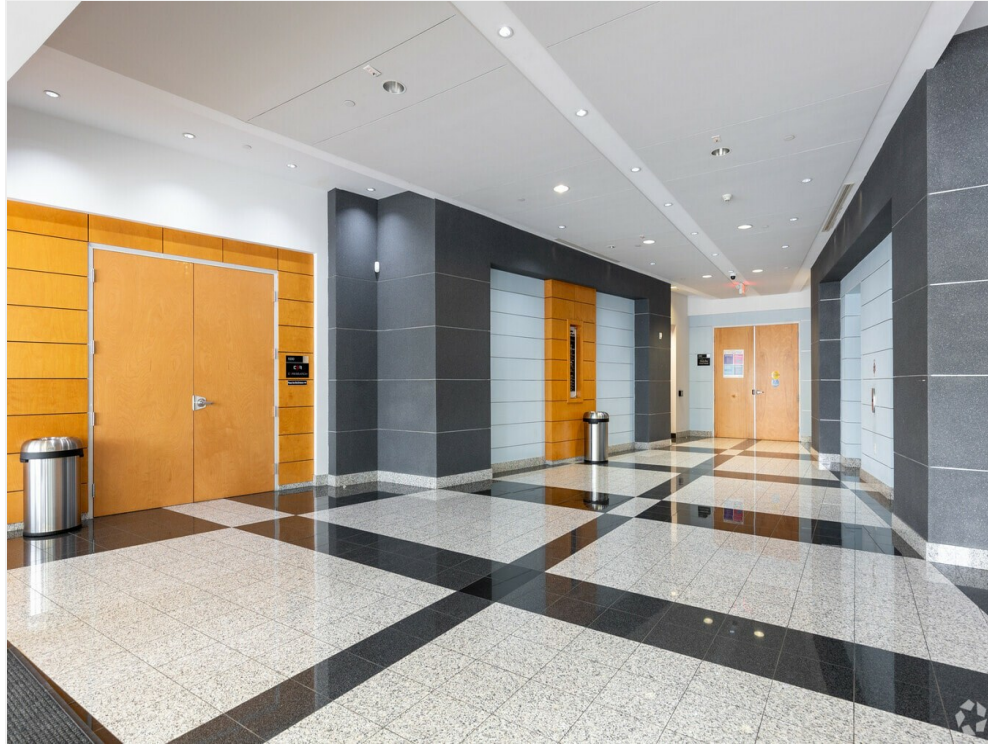
Entrance to Suite 1030