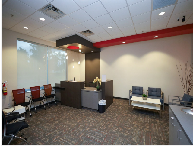
Suite 1030 Reception