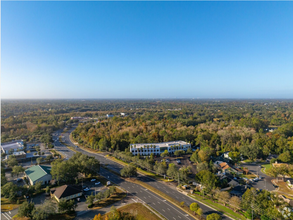
7560 Red Bug Lake Rd Oviedo, FL 32765