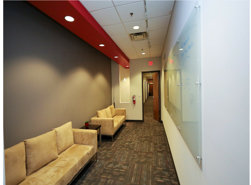
Suite 1010 Reception