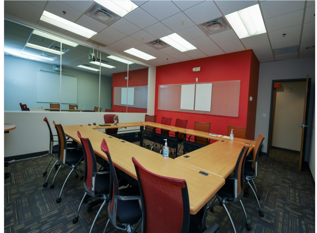
Research Suite 1