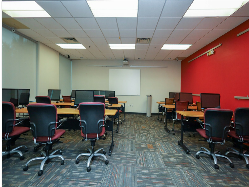
Large Seminar Room