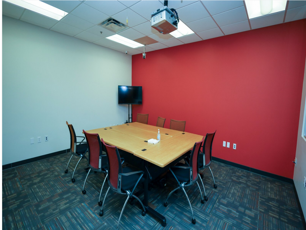
Research Suite 2