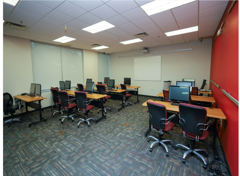
Large Seminar Room