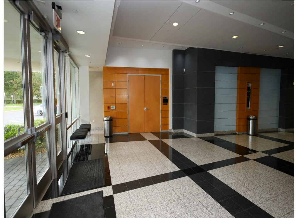
Entrance to Building