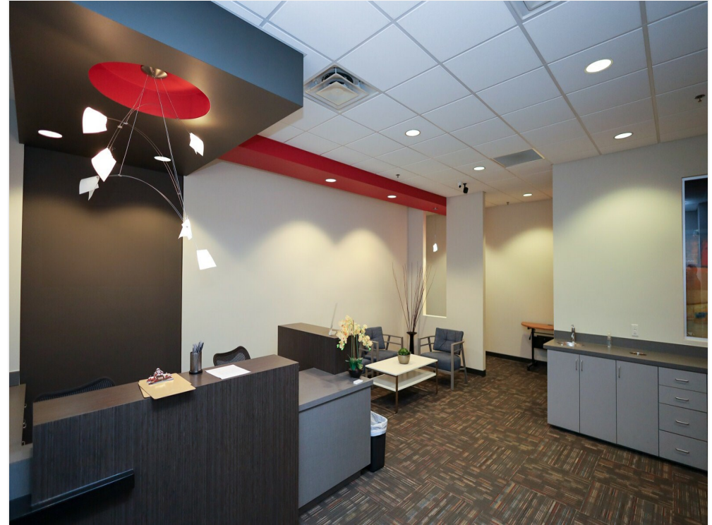
Reception Suite 1030