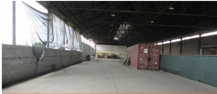
E1 Canopy Area