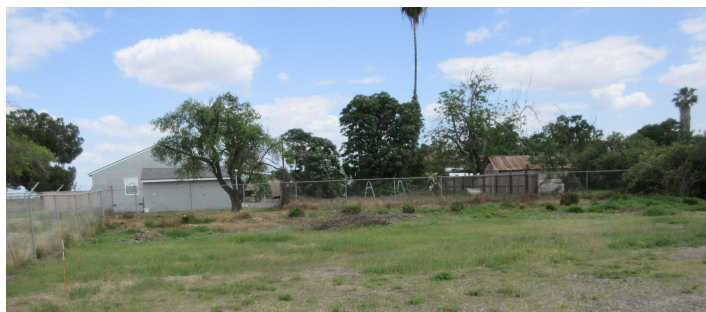
C2D Laydown Area