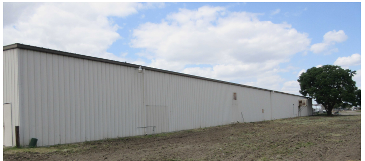
A1 Laydown Area