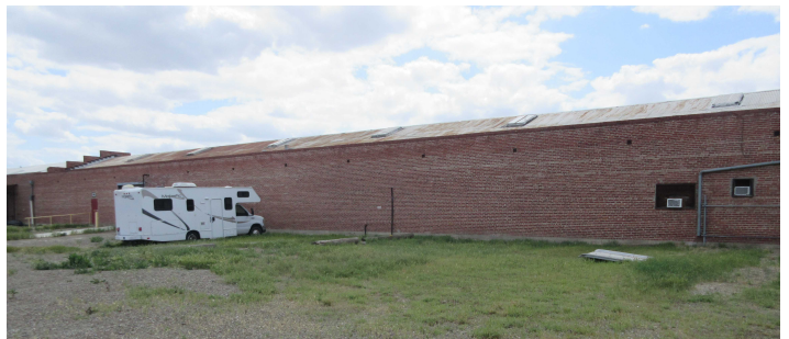
C2A-C2B Laydown Area