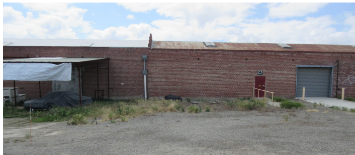
C2C Laydown Area