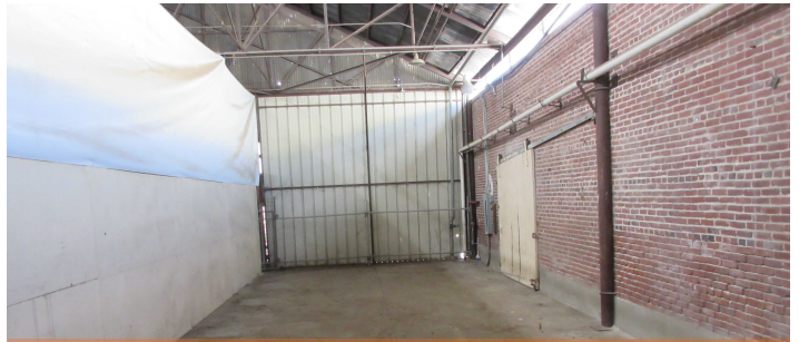
E4 Canopy Area