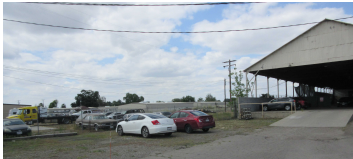
E1A Laydown Area