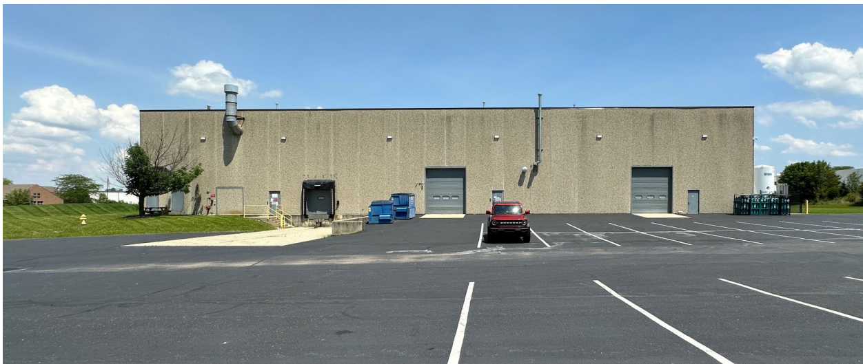
Photo - Exterior