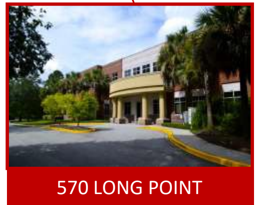
570 LONG POINT

Several spaces in move-in condition. Landlord will upfit per tenants' specifications. Generous improvement allowance available.