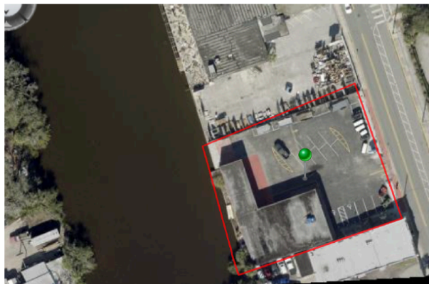
Address: 594 BALLOUGH ROAD, DAYTONA BEACH 32114 Size: 0.49 Acres