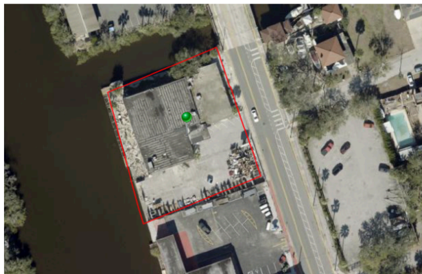
Address: 600 BALLOUGH ROAD, DAYTONA BEACH 32114 Size: 0.66 Acres