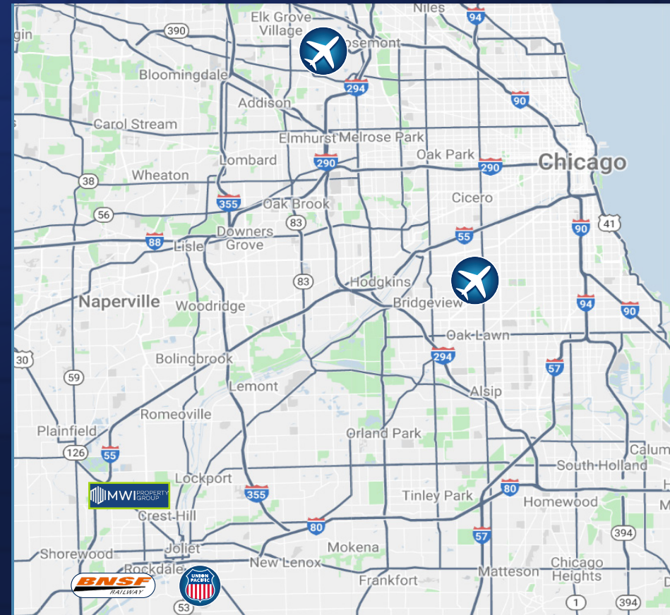
No warranty or representation, expressed or implied, is made as to the accuracy of the information contained herein, and same is submitted subject to error and omission.