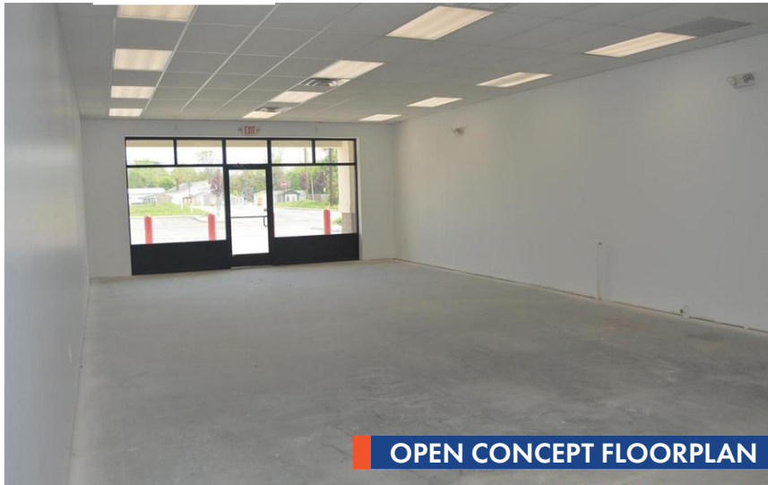
OPEN CONCEPT FLOORPLAN