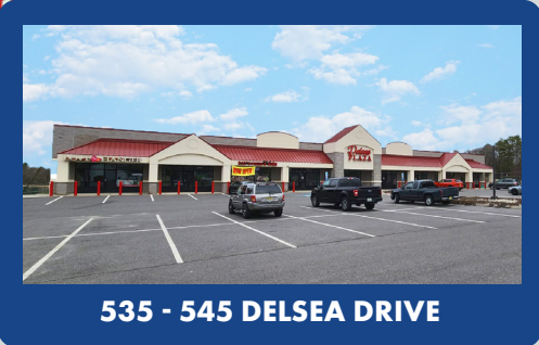
535 - 545 DELSEA DRIVE