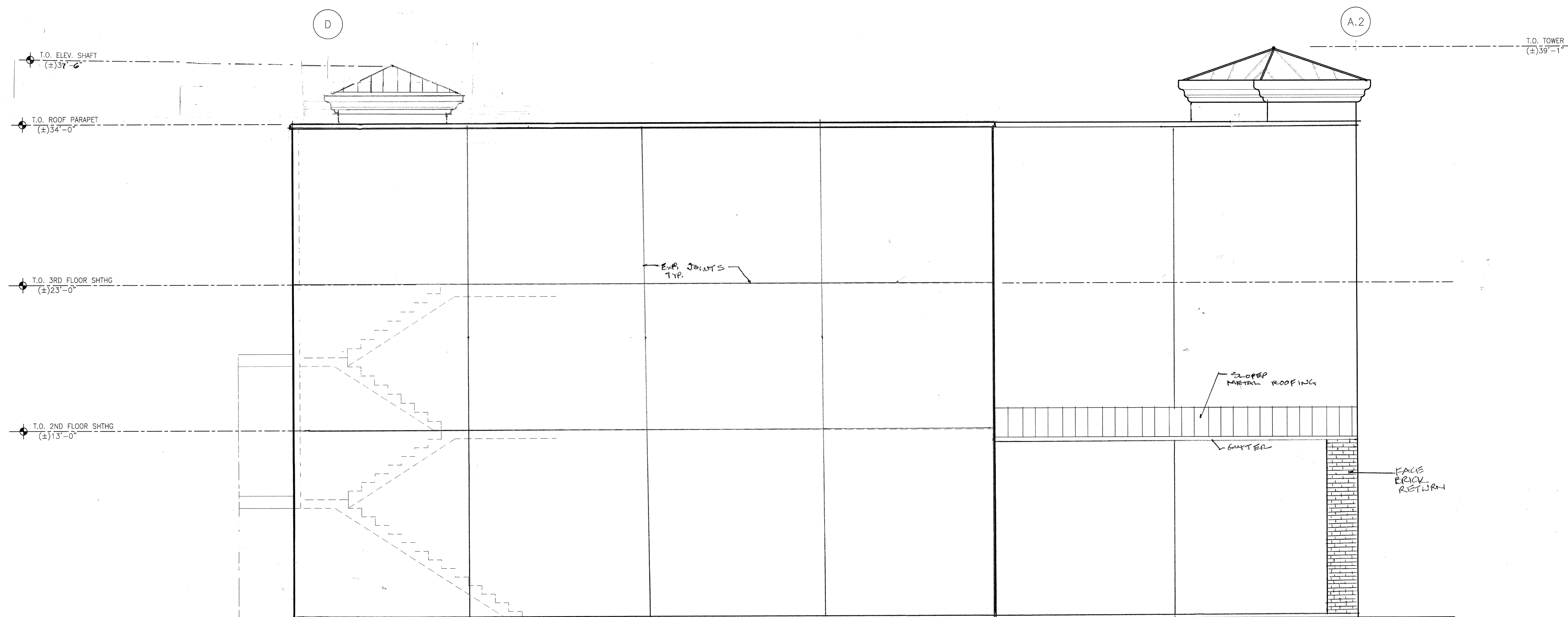
1 SIDE ELEVATION