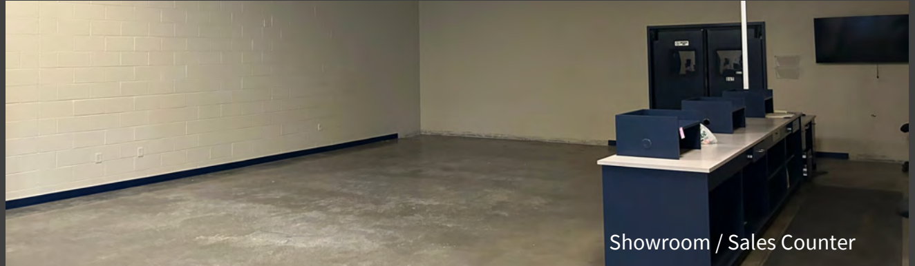
Showroom / Sales Counter