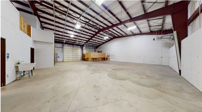
WAREHOUSE WITH TWO 14' ROLLUP DOORS

8410 30TH AVE NE, LACEY, WA | HOGUM BAY WAREHOUSE