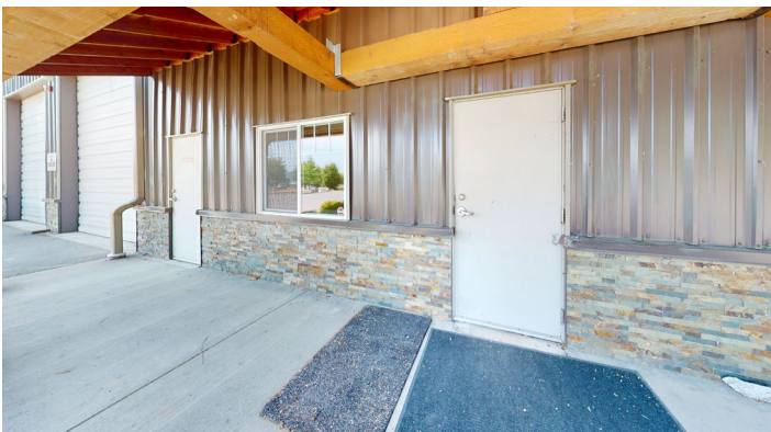
SUITE C ENTRY