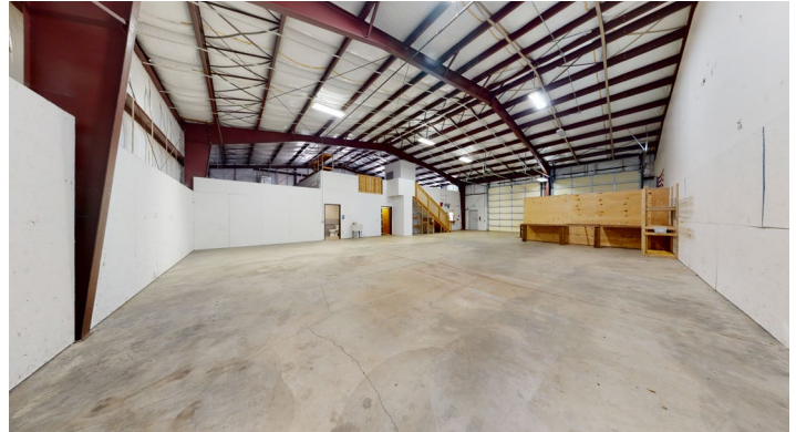
WAREHOUSE - FACING MEZZANINE