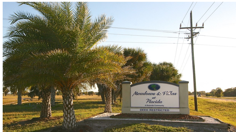
Entrance to the subdivision.