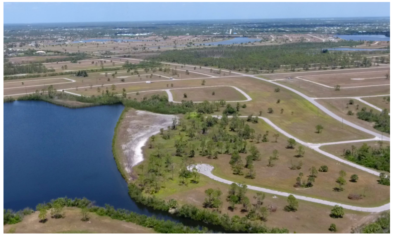
Aerial of the development site.