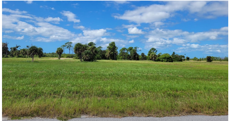
Property facing west from Rotonda Trace.