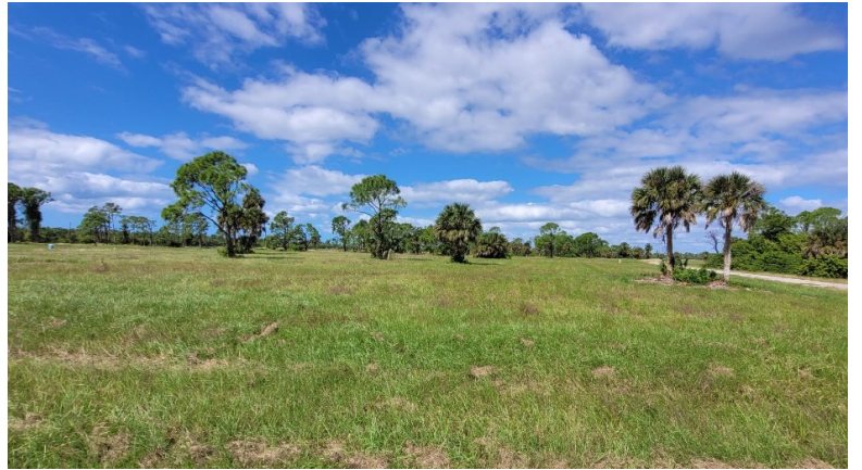
Property facing north from Haring Way.