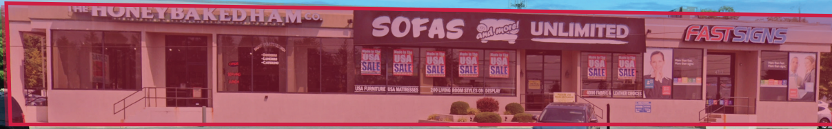
CARLISLE PIKE (ROUTE 11)