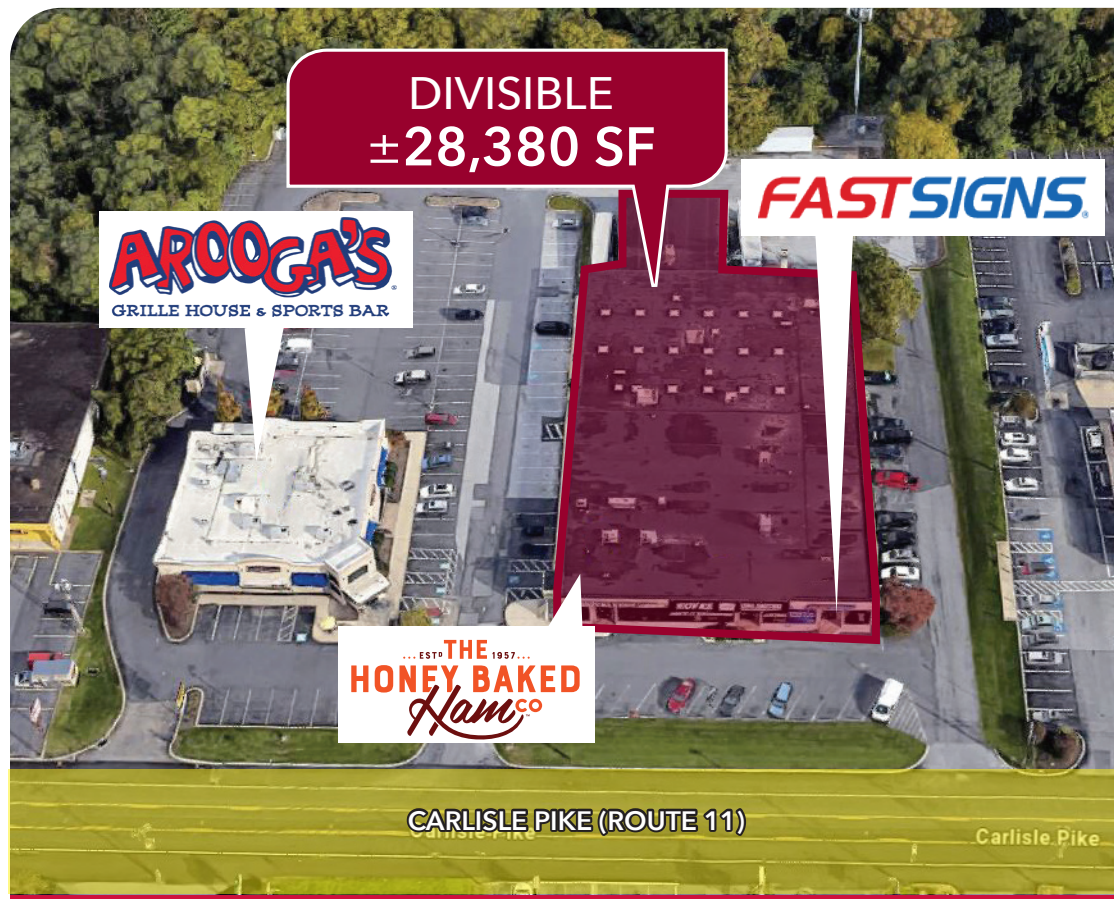
CARLISLE PIKE (ROUTE 11)