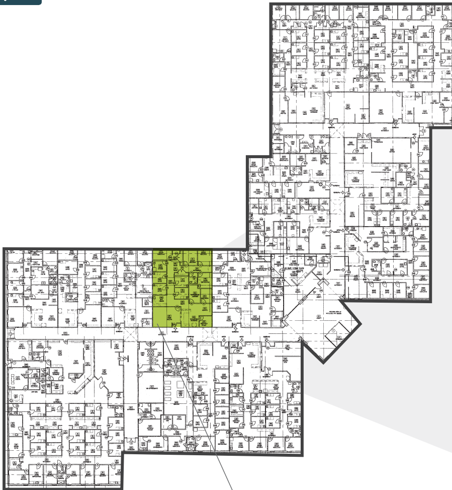
▶ SUITE 500 Size: 2,980 RSF