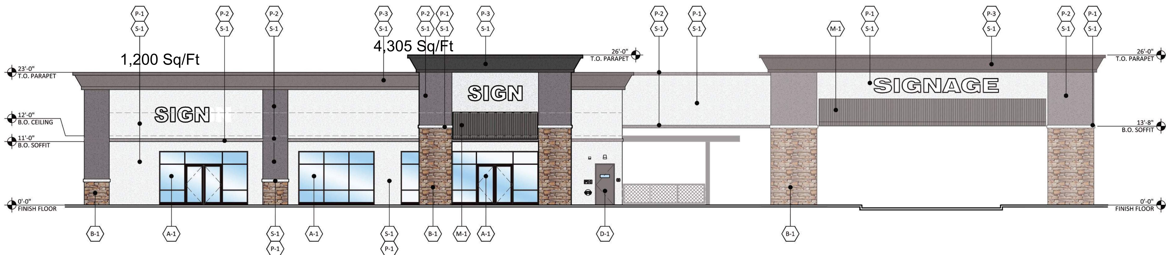
4 NORTH ELEVATION - SHOPS BUILDING SCALE: 1/8" = 1'-0"