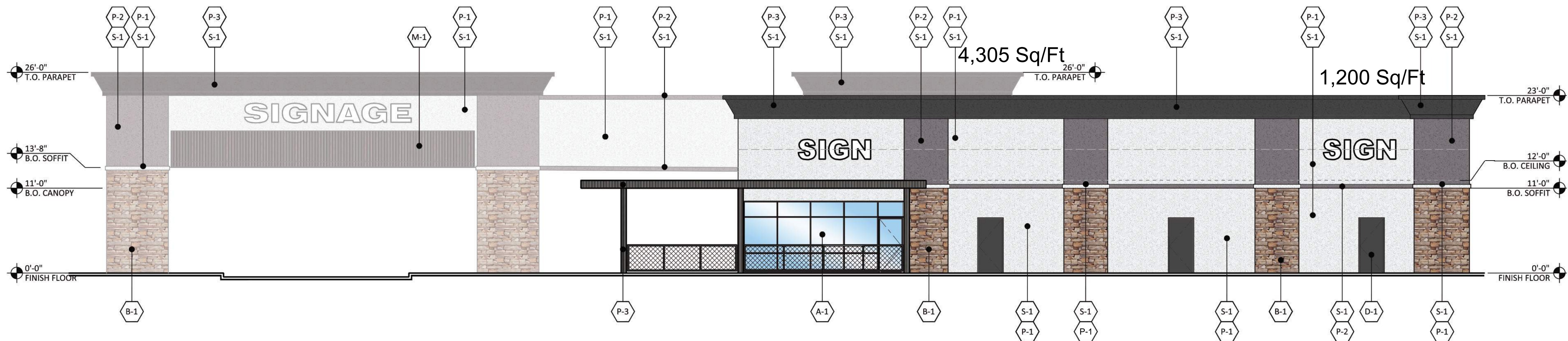
1 SOUTH ELEVATION - SHOPS BUILDING SCALE: 1/8" = 1'-0"