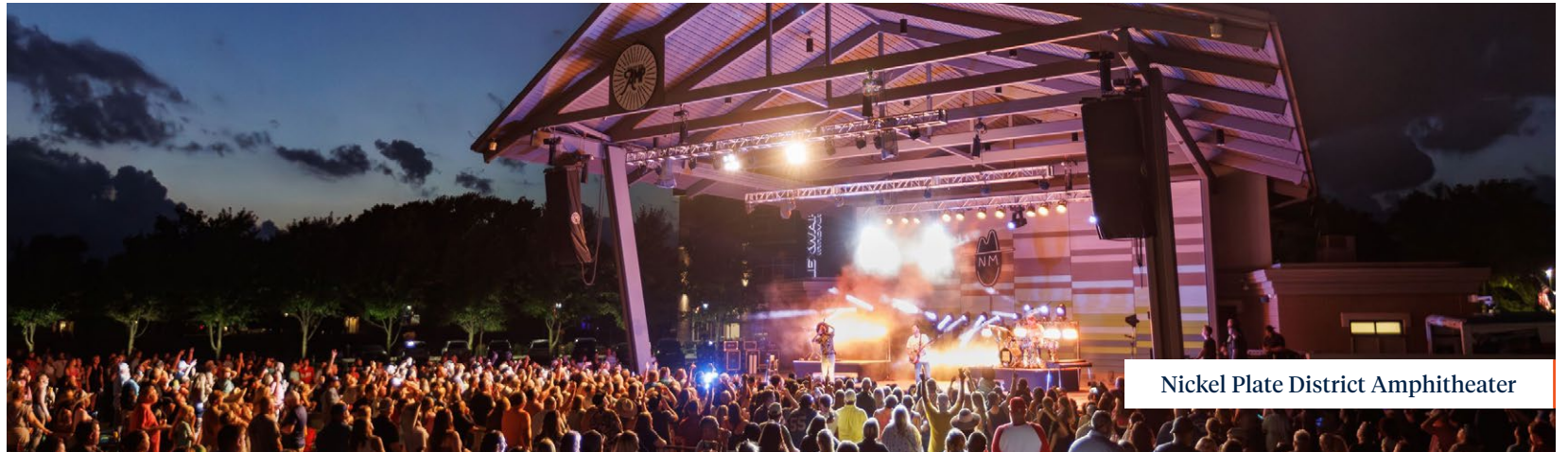
Nickel Plate District Amphitheater