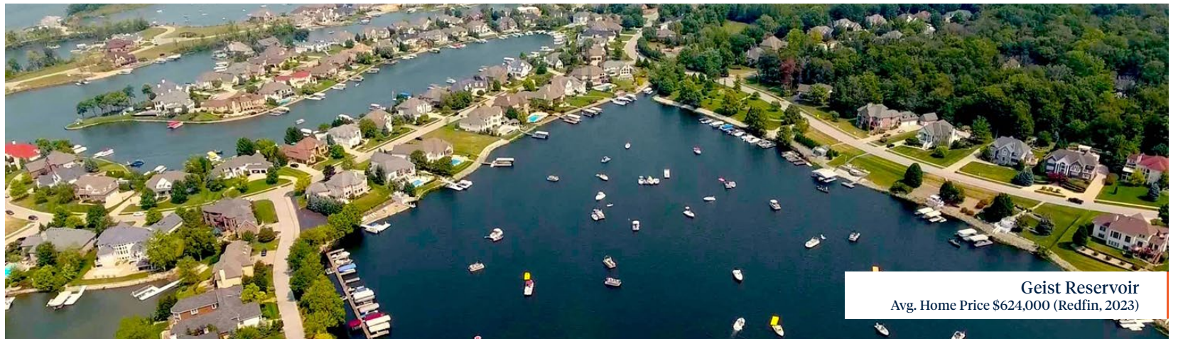
Geist Reservoir Avg. Home Price $624,000 (Redfin, 2023)