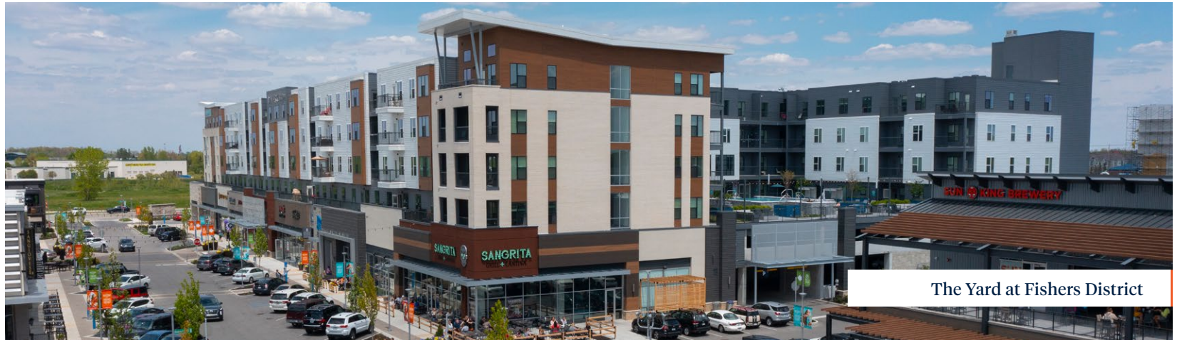
The Yard at Fishers District