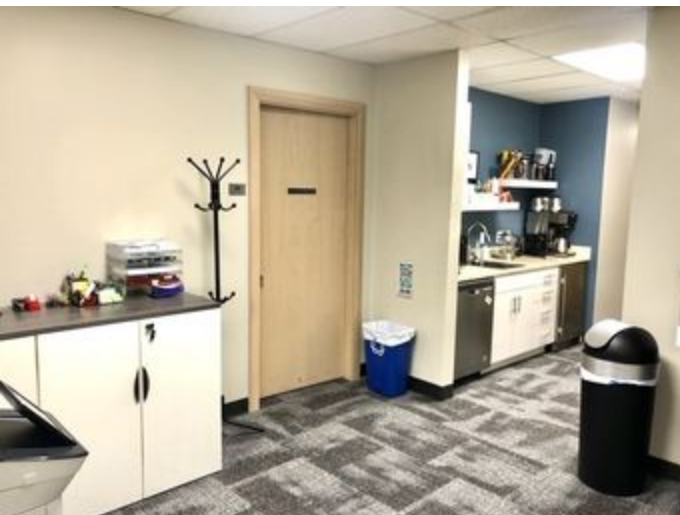
Suite 200 Kitchenette