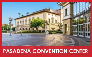
PASADENA CONVENTION CENTER