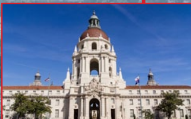
PASADENA CITY HALL