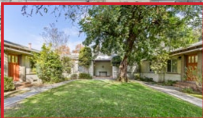
771 N LOS ROBLES AVE