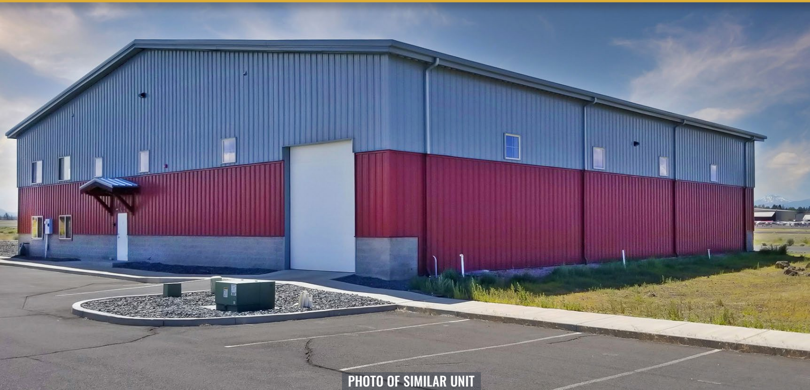
PHOTO OF SIMILAR UNIT

63205 Gibson Air Road, Unit 7, Bend, OR 97701