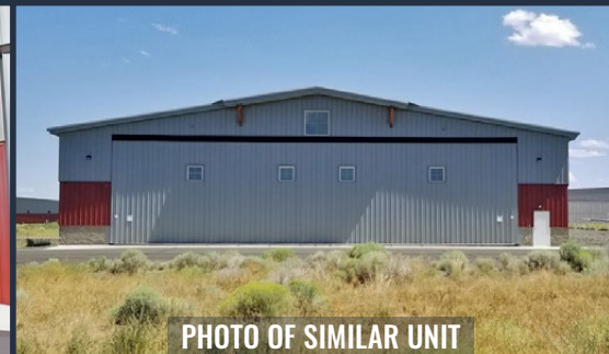
PHOTO OF SIMILAR UNIT