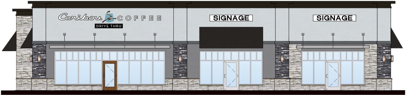
1 FRONT/PLAN SOUTH ELEVATION