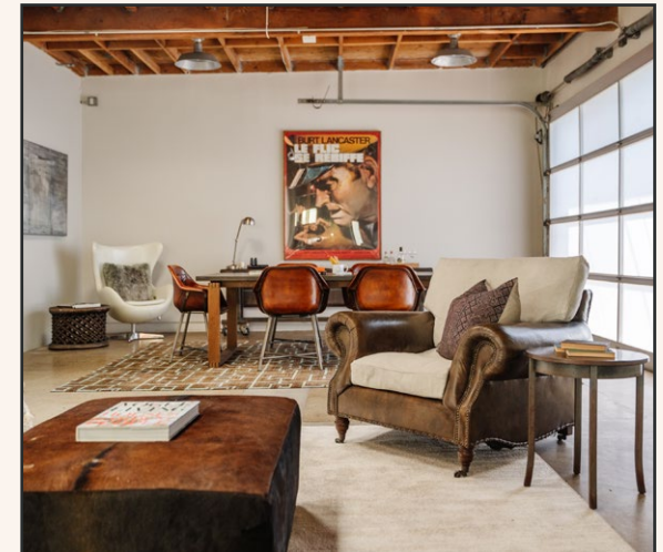
Versatile workspace - Spacious layout with natural light and mid-century modern accents.