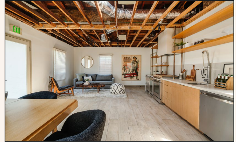
Open living and workspace - Stylish interiors with exposed ceilings and flexible layout for live-work potential.