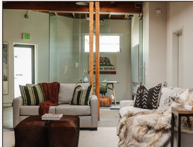
Cozy meeting area - Bright and inviting lounge space perfect for collaboration or relaxation.