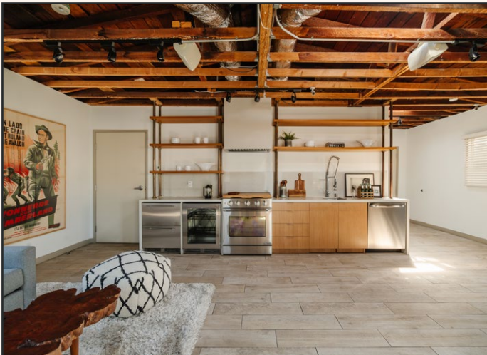
Fully equipped kitchen - Modern kitchen with premium appliances and open shelving for a sleek design.