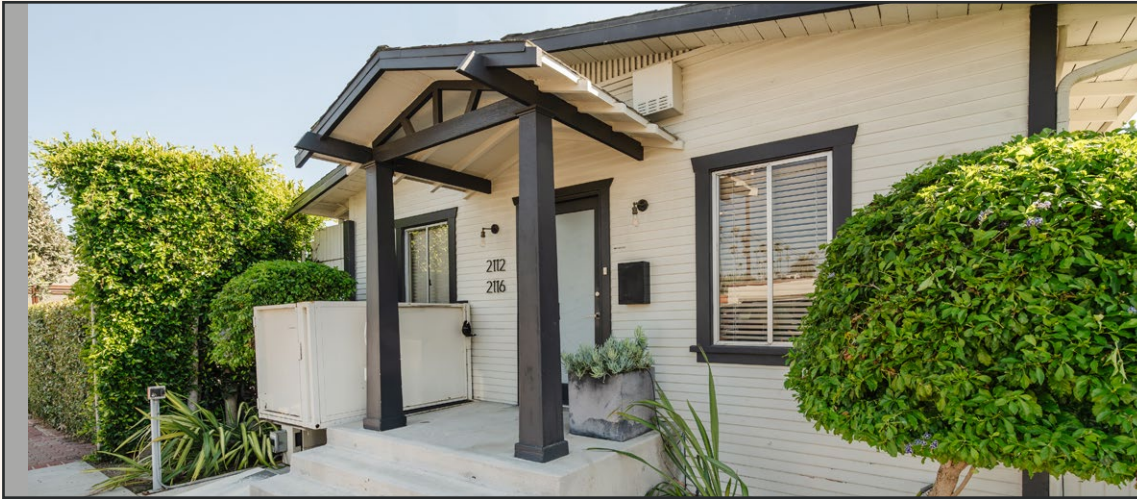
Charming exterior - Classic façade with updated details and lush landscaping.