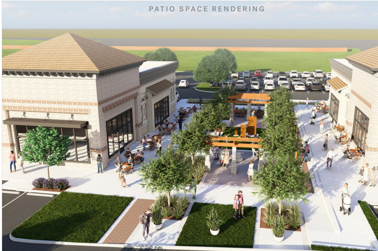
PATIO SPACE RENDERING