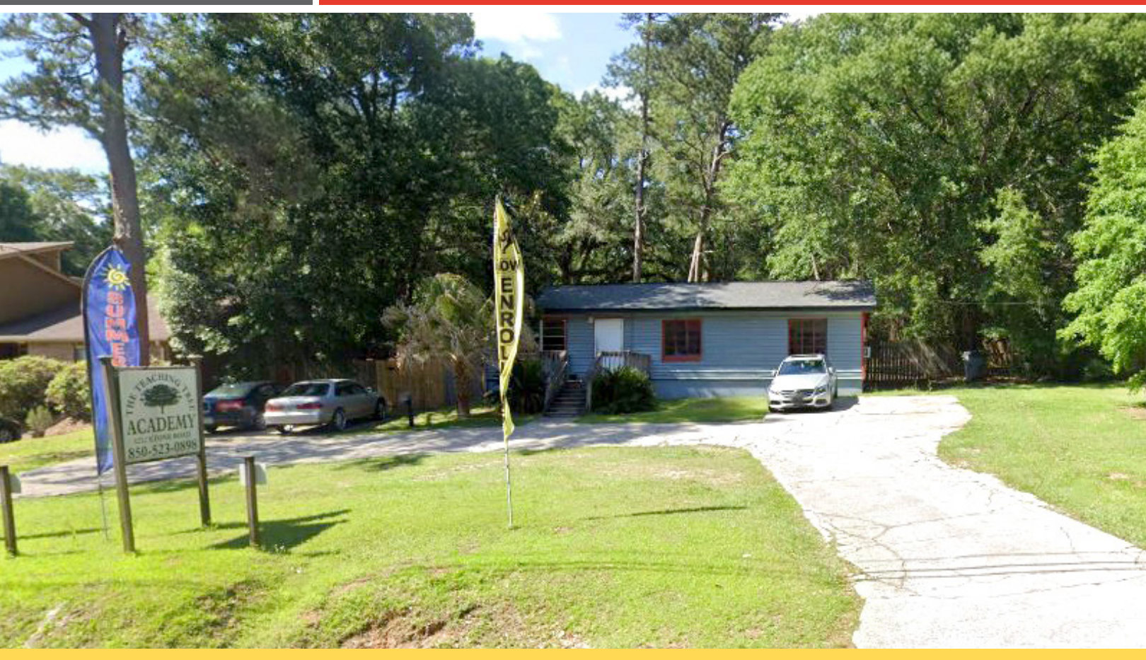
*DO NOT CONTACT TENANT* All showings must be coordinated through listing agent - contact info below.

1212 STONE ROAD · TALLAHASSEE FL · 32303