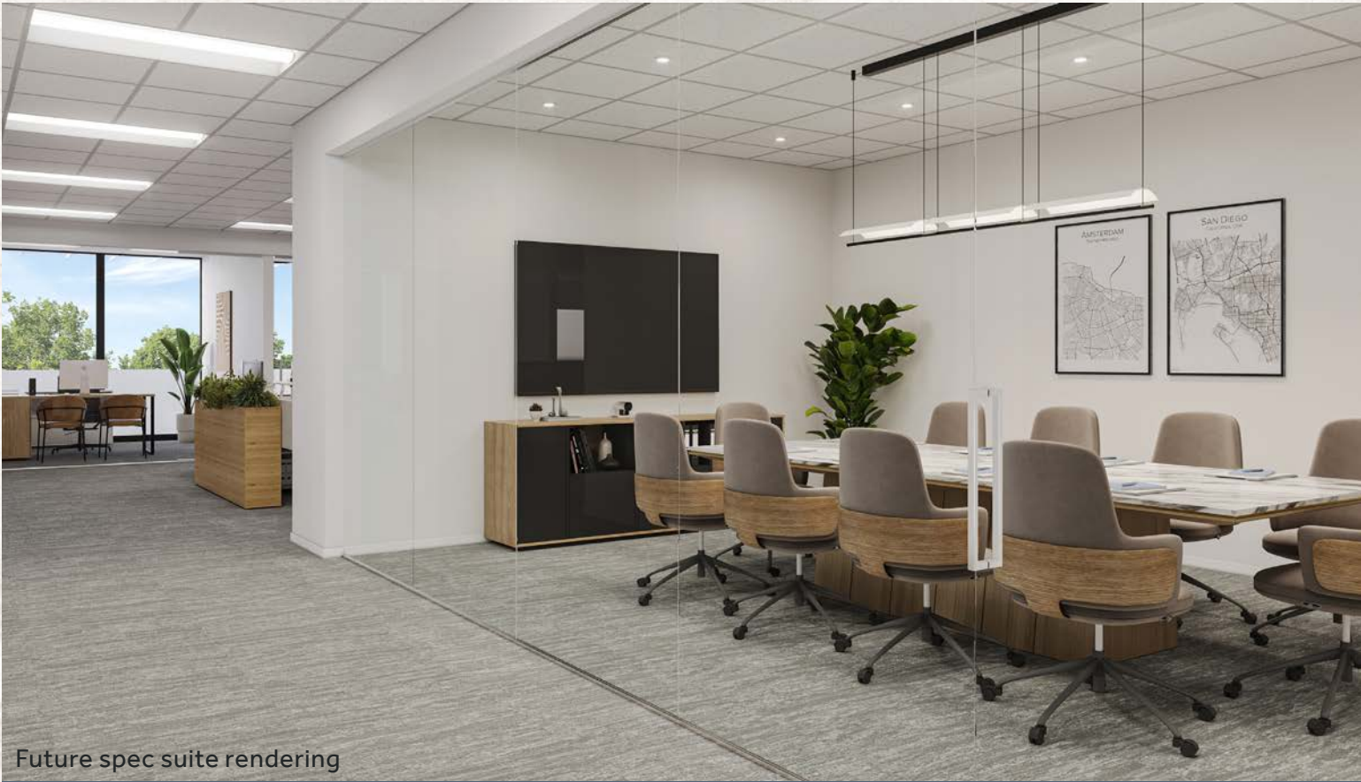
Future spec suite rendering