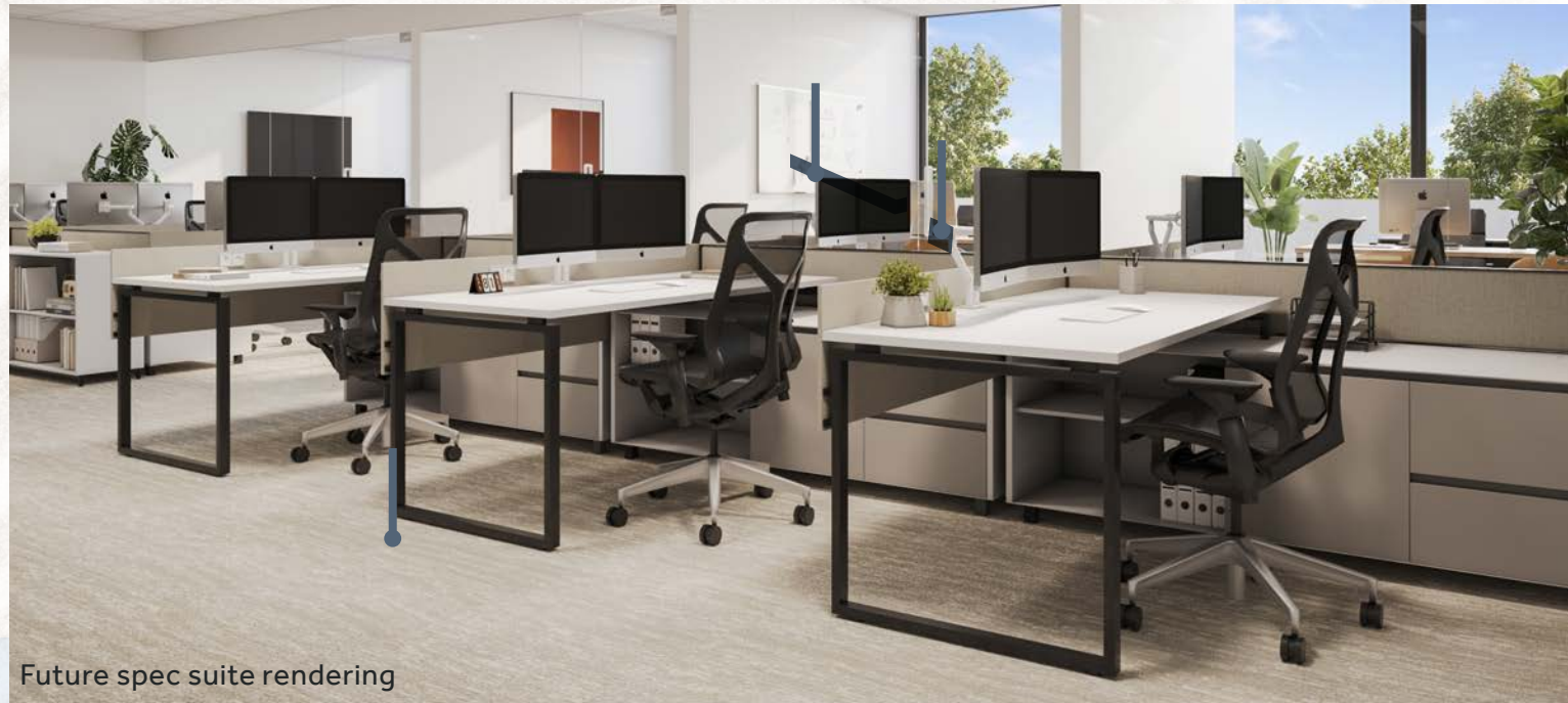
Future spec suite rendering