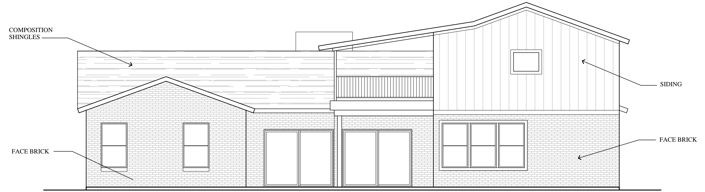
03 NORTH ELEVATION 3/16" = 1'-0"