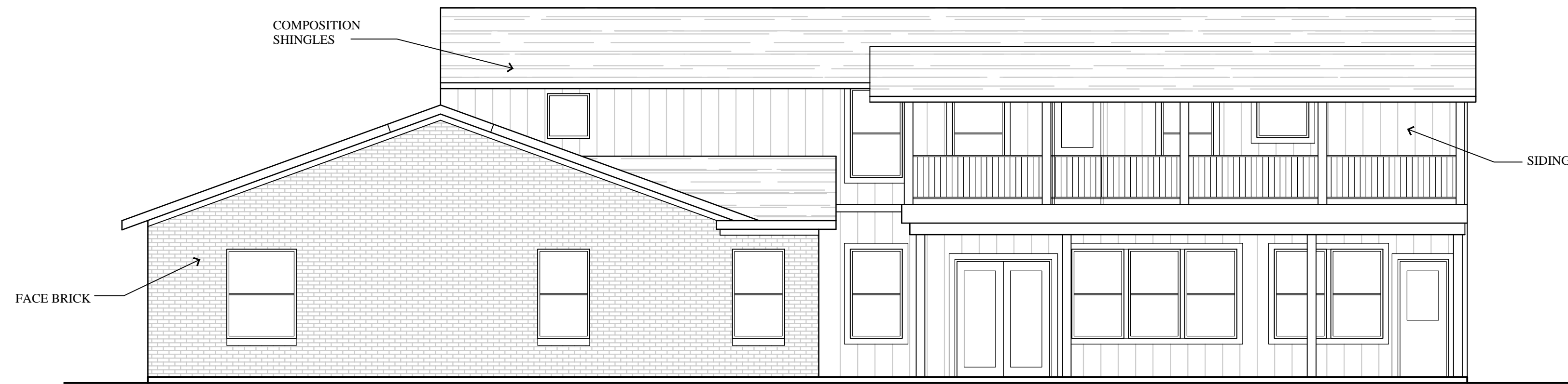
02 EAST ELEVATION 3/16" = 1'-0"