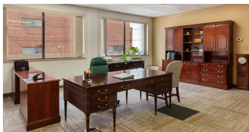
Upper Level Space