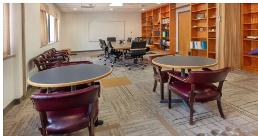
Upper Level Space