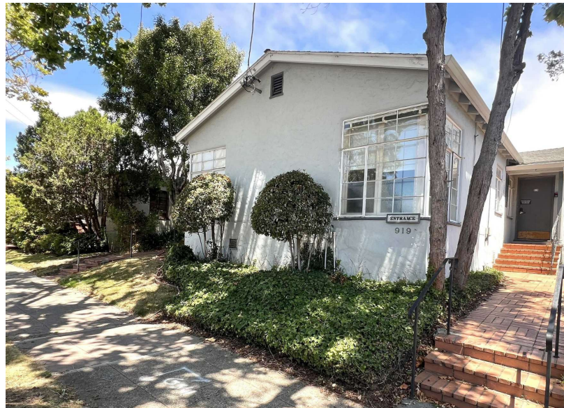
919 The Alameda