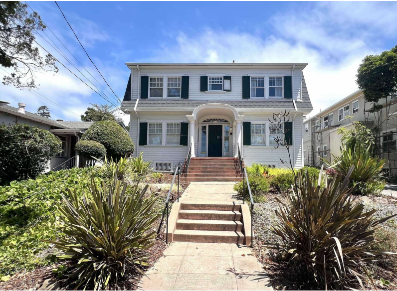
921 The Alameda