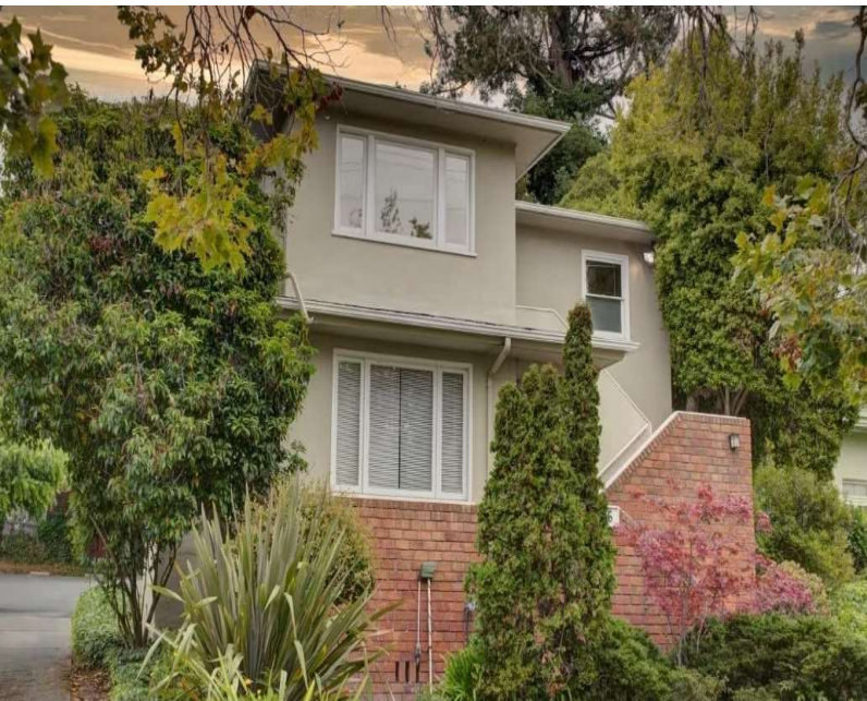
925 The Alameda