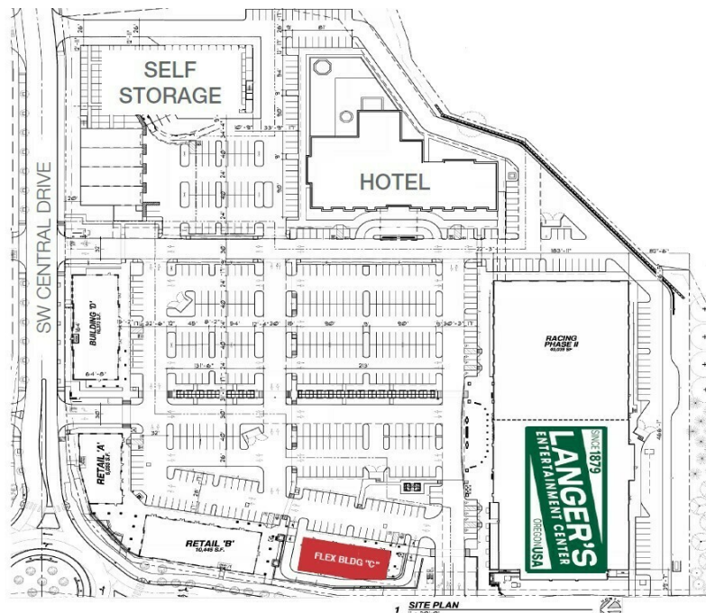
SW LANGER FARMS PARKWAY

Suite C7, Building C NNN / 3,035 SF @ $1.75 SF/month