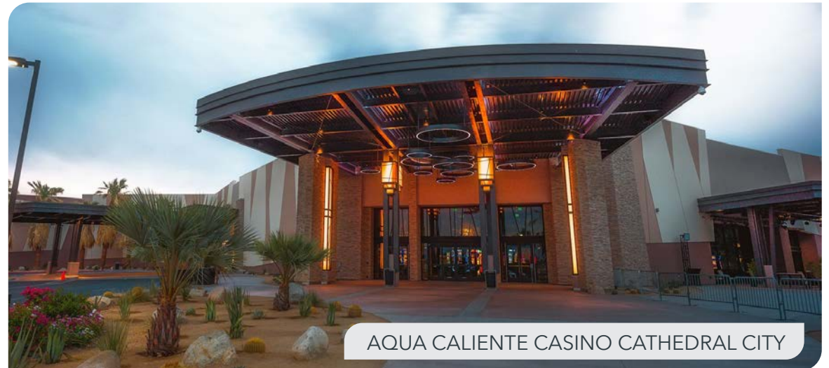
AQUA CALIENTE CASINO CATHEDRAL CITY

Highway 111 & Date Palm Traffic Counts = 37,384 ADT