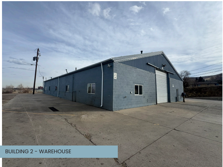
BUILDING 2 - WAREHOUSE