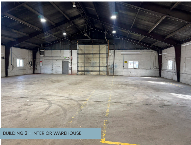
BUILDING 2 - INTERIOR WAREHOUSE