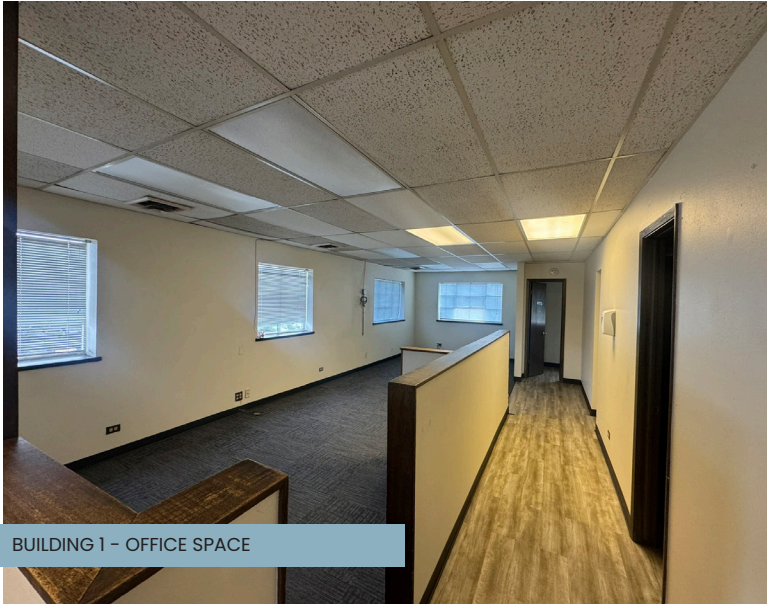
BUILDING 1 - OFFICE SPACE