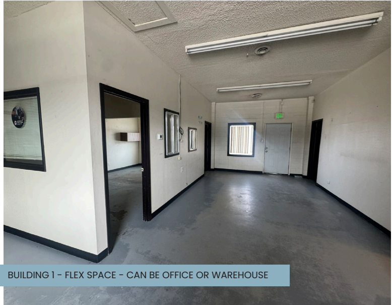
BUILDING 1 - FLEX SPACE - CAN BE OFFICE OR WAREHOUSE