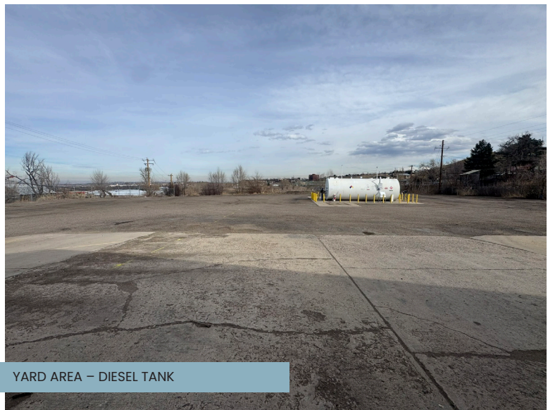
YARD AREA - DIESEL TANK