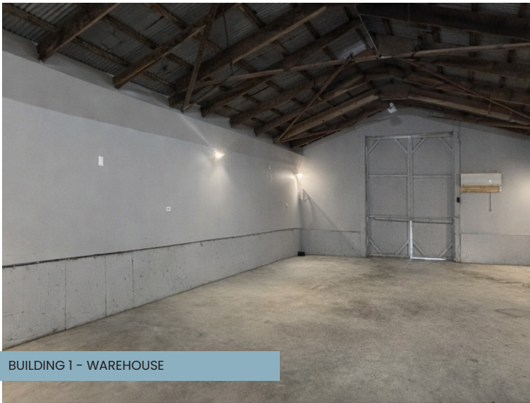
BUILDING 1 - WAREHOUSE