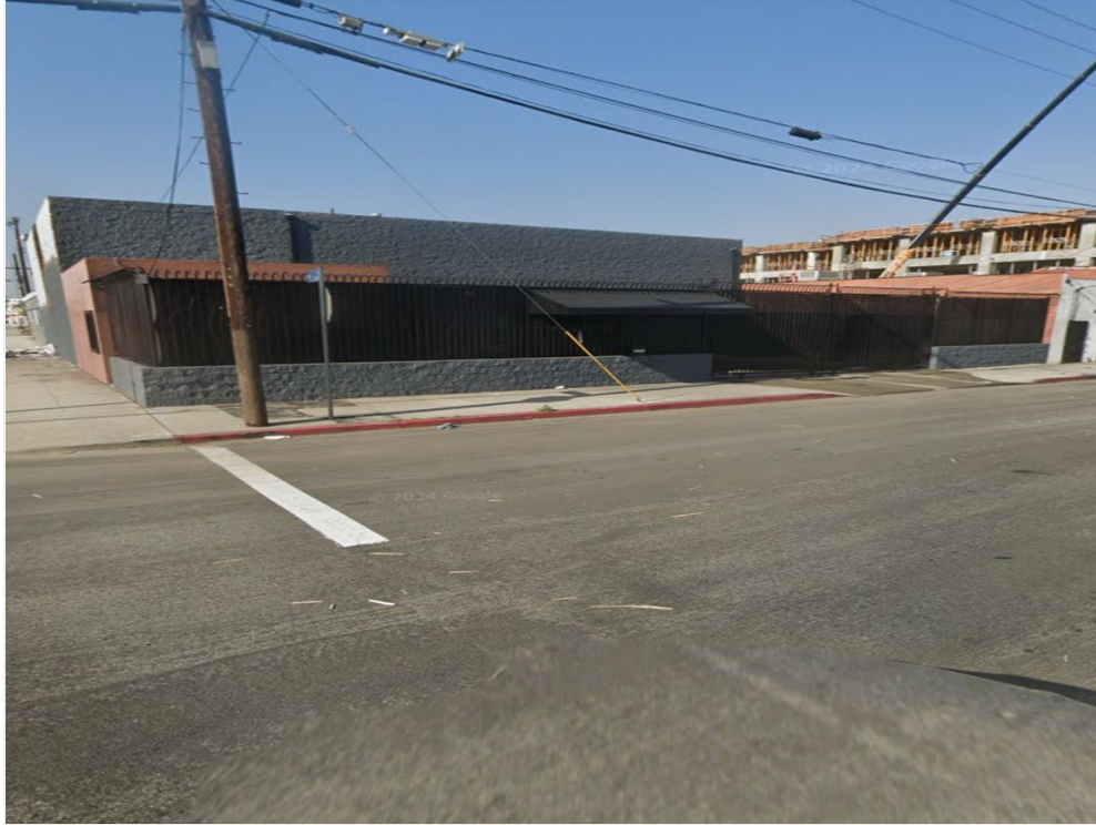
220 W 21st St - Google Maps picture