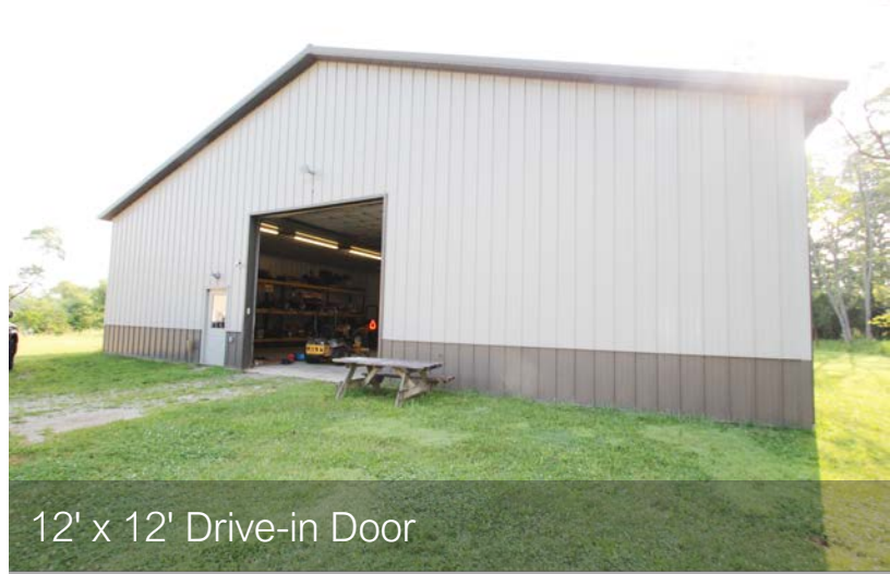
12' x 12' Drive-in Door