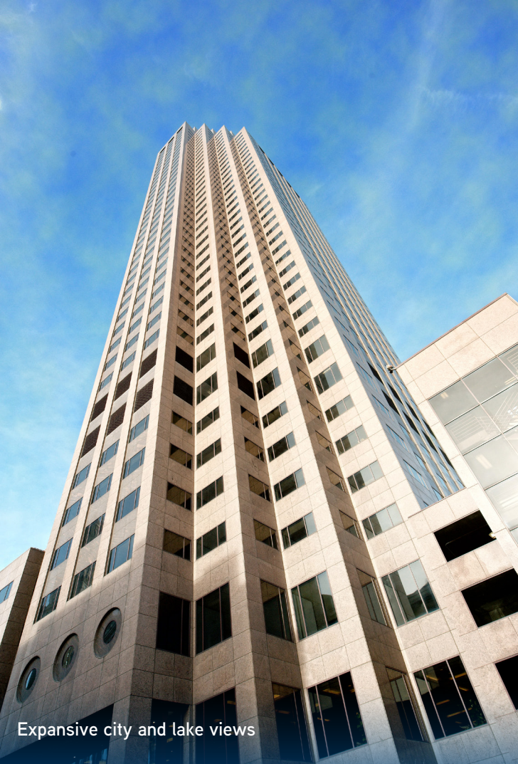
Expansive city and lake views

200 Public Square is a 45-story, 1.2 M square foot, Class A office building in Cleveland's Central Business District with strong, well capitalized ownership and an impressive tenant roster.