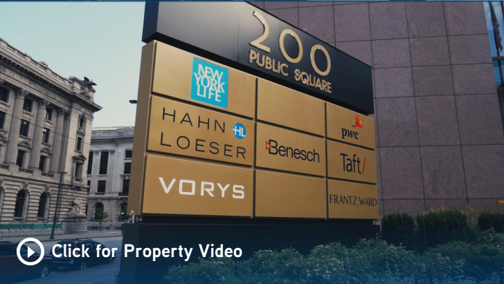
Click for Property Video