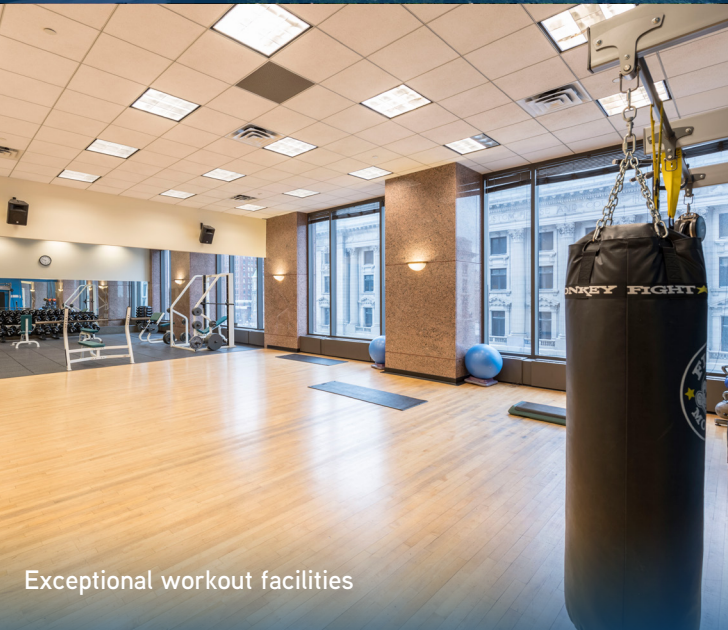
Exceptional workout facilities