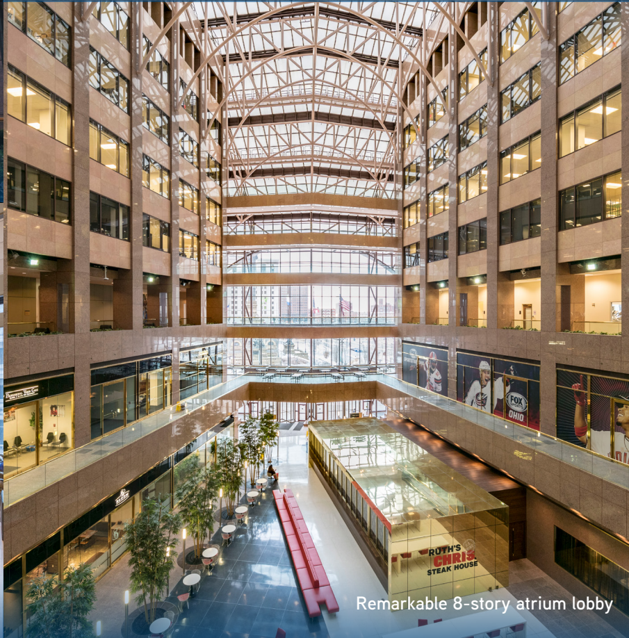
Remarkable 8-story atrium lobby