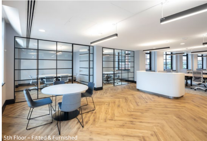
5th Floor – Fitted & Furnished