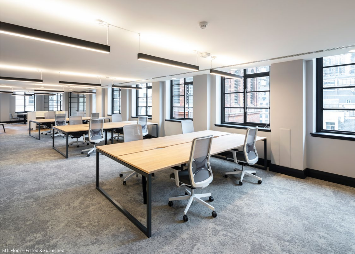
5th Floor – Fitted & Furnished