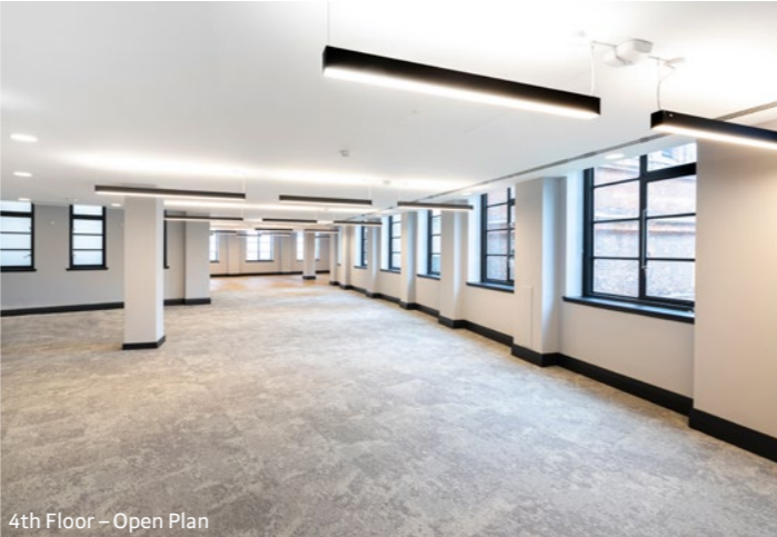
4th Floor – Open Plan