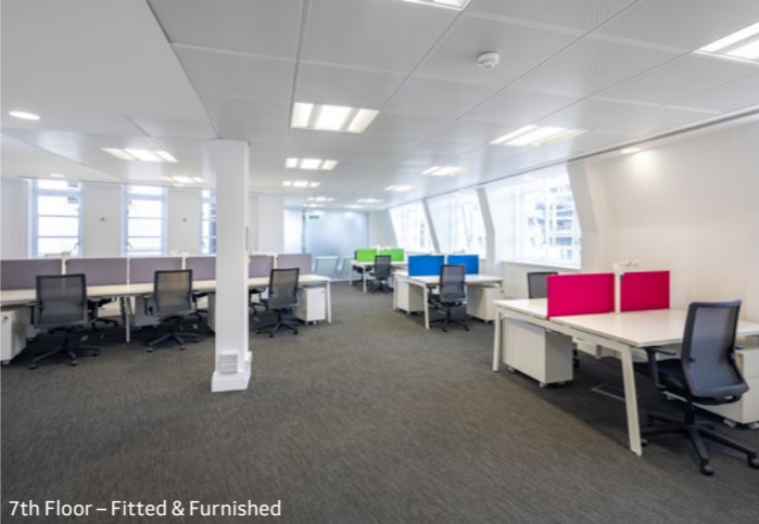
7th Floor – Fitted & Furnished