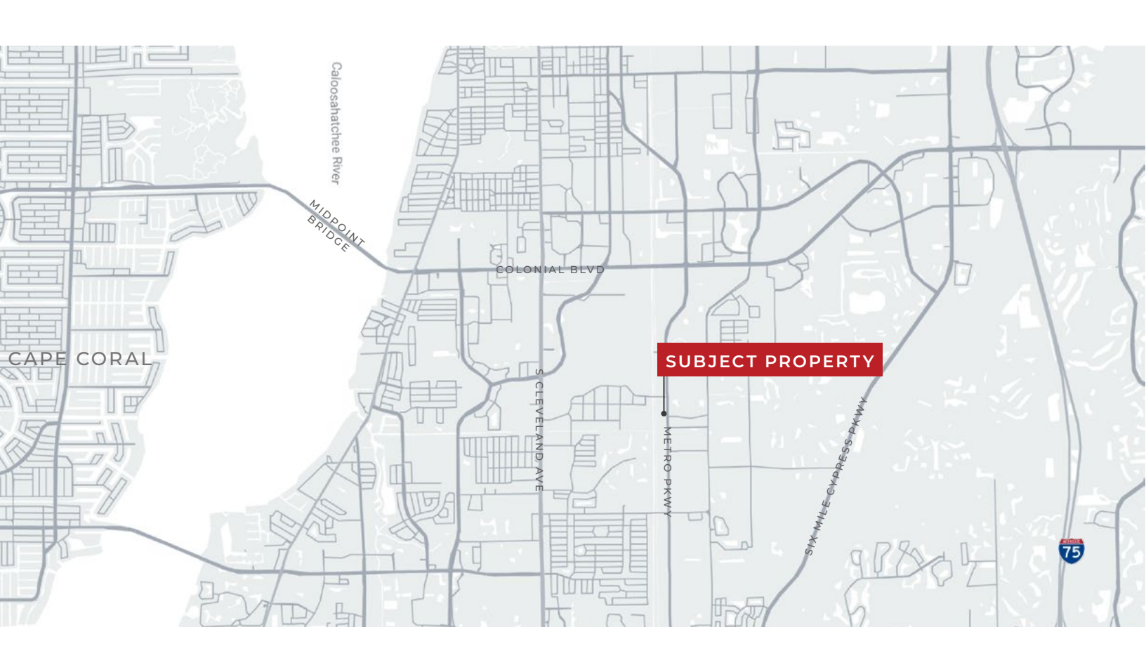
This marketing brochure serves as a reference for informational purposes only and does not constitute an offer for sale or lease, nor does it serve as a solicitation for an offer to purchase or lease. While the information contained herein is believed to be reliable, its accuracy, completeness, or reliability cannot be guaranteed. Prospective buyers or lessees are encouraged to conduct their own investigations and due diligence to verify the information provided. All descriptions, dimensions, conditions, permissions for use, and other details are offered in good faith but are subject to verification. No express or implied warranty or representation is made regarding the accuracy of the information herein. The content is subject to errors, omissions, price changes, withdrawal without notice, and any special listing conditions imposed by our principals.