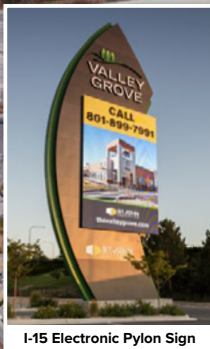
I-15 Electronic Pylon Sign