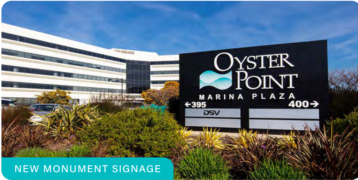
NEW MONUMENT SIGNAGE