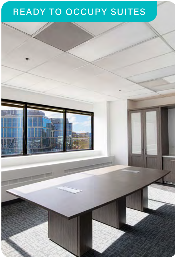
READY TO OCCUPY SUITES