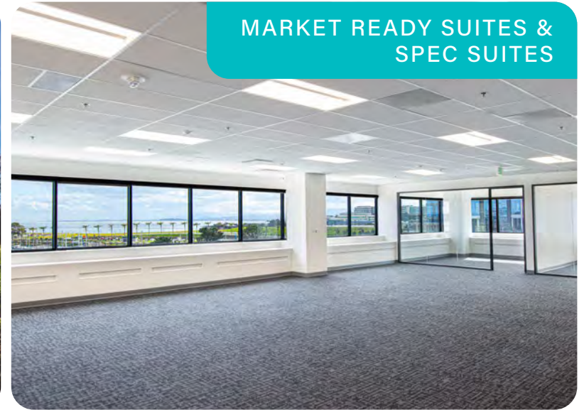
MARKET READY SUITES & SPEC SUITES