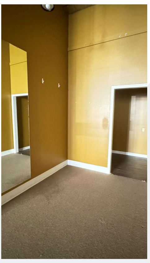
@2024 Bradley Company, LLC and affiliates. Use of any third party name or mark is for informational purposes only and does not indicate sponsorship or endorsement by such party. Not all information has been independently verified, and the presenting broker makes no guarantee about its accuracy. Any projections, opinions, or estimates are for example only. Before completing a real estate transaction, you and your advisors should conduct an independent investigation of the property to determine its suitability for your needs.