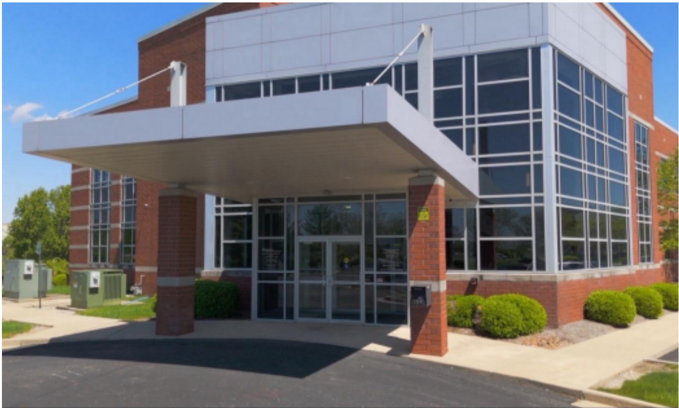
Actual picture taken at location