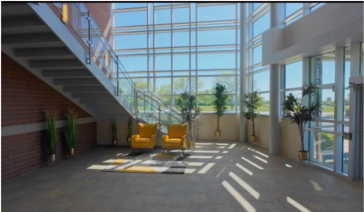
Actual picture taken at location