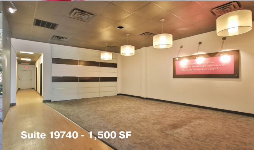
Suite 19740 - 1,500 SF