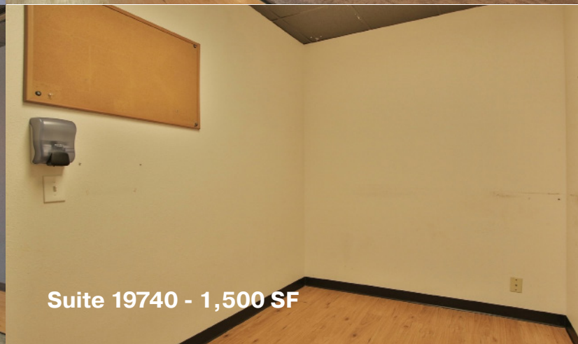
Suite 19740 - 1,500 SF