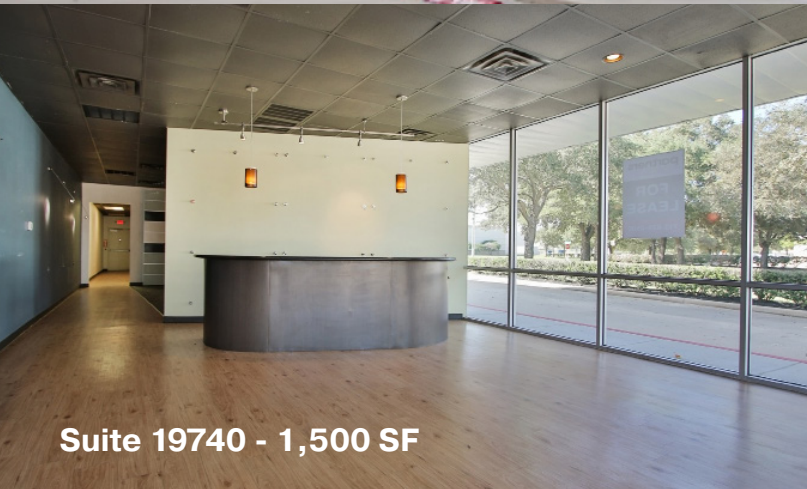
Suite 19740 - 1,500 SF