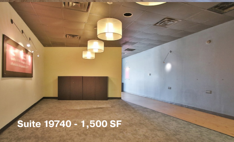
Suite 19740 - 1,500 SF