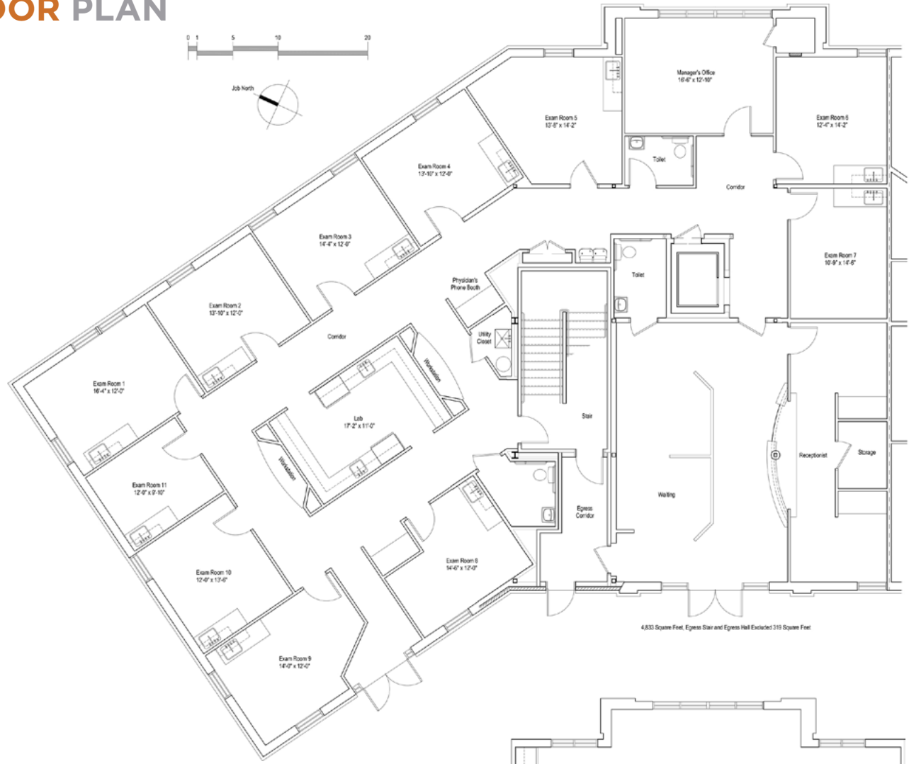
4,833 Square Feet, Egress Stair and Egress Hall Excluded: 3,115 Square Feet