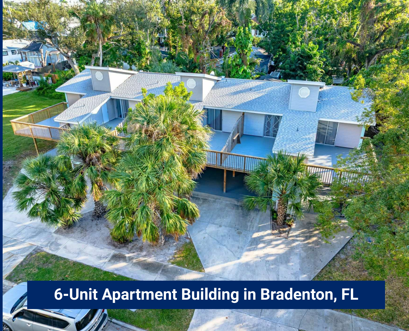
6-Unit Apartment Building in Bradenton, FL