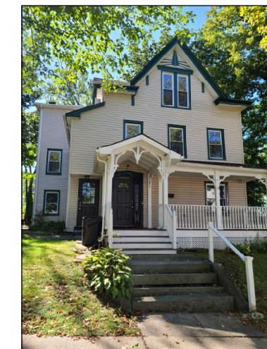
70 SECOND STREET