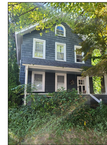
74 SECOND STREET