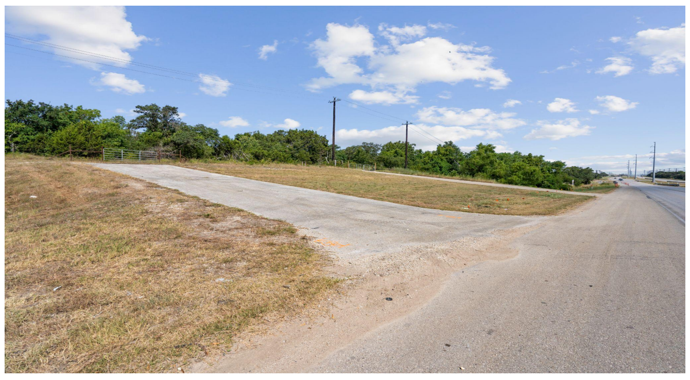
Lot 6 Access Road