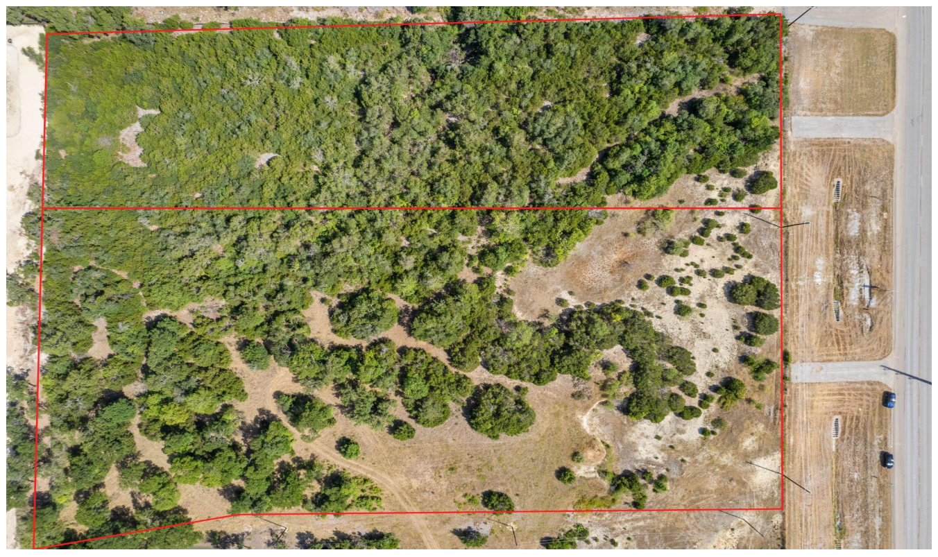
Lot 5 and Lot 6