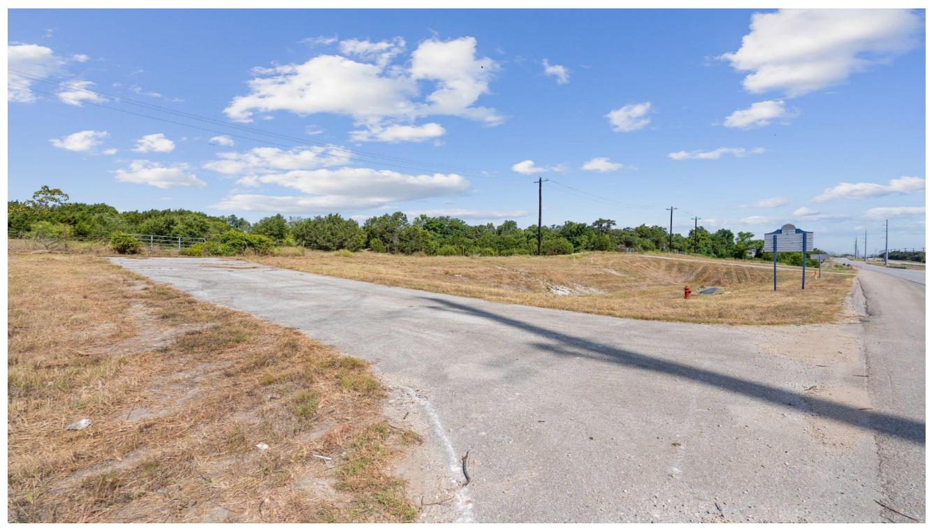
Lot 5 Access Road