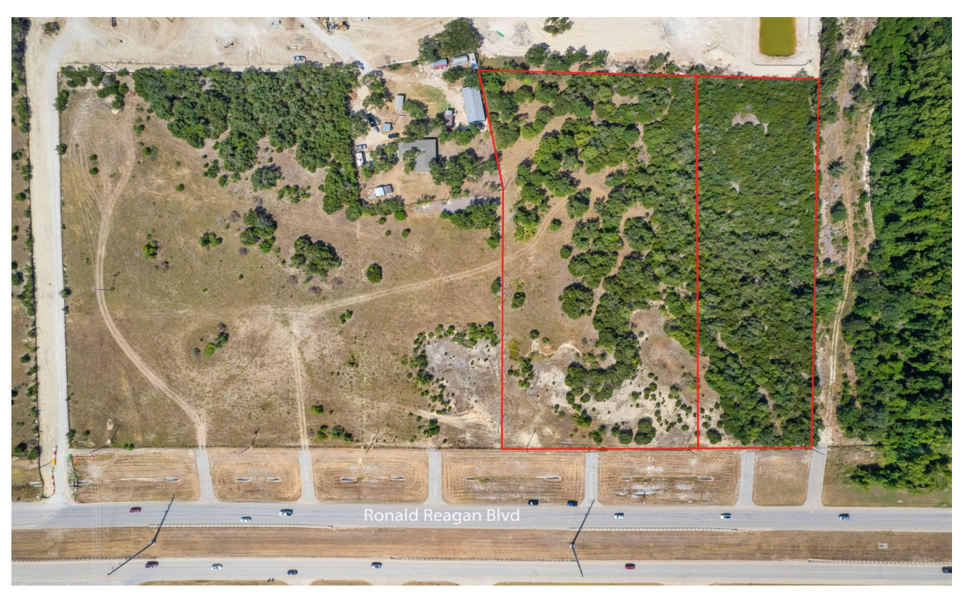
Lot 5 and Lot 6