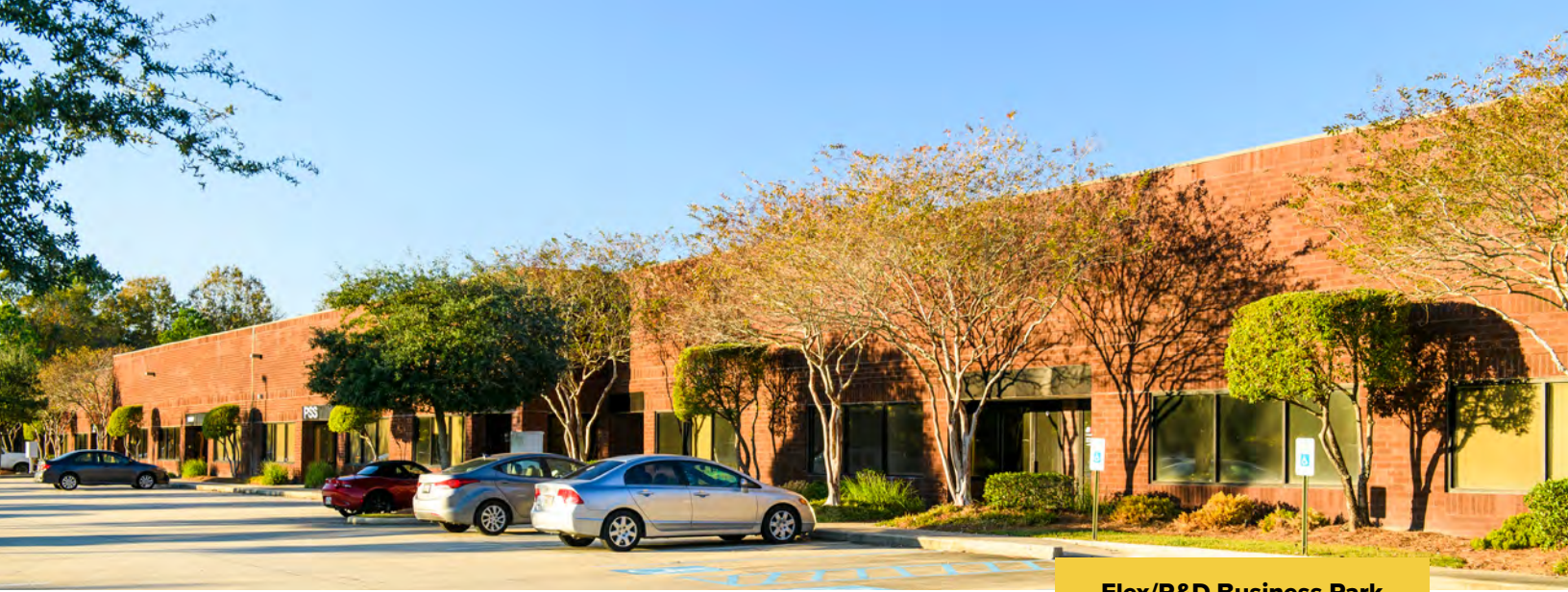
Flex/R&D Business Park