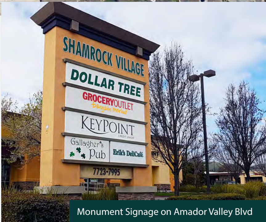
Monument Signage on Amador Valley Blvd