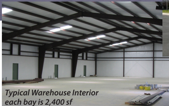
Typical Warehouse Interior each bay is 2,400 sf

For more information contact : Johanna W Money